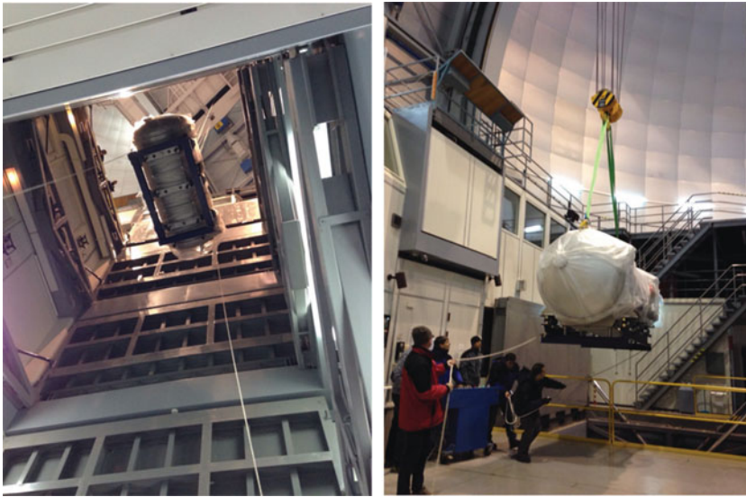
Figure 2. The near-infrared spectrograph was moved to Calar Alto Observatory and installed in the coude laboratory of the 3.5 m telescope on Oct 20, 2015. The vacuum tank of the visible-light spectrograph is nearly identical; it was installed already in August.