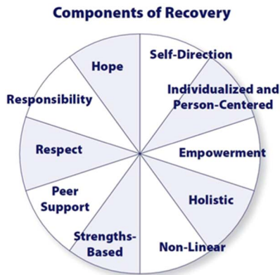
FIGURE 1. SAMHSA components and principles of recovery for individuals and organizations.

inpatient psychiatric units jeopardize the healing environment necessary to provide effective treatment and to empower the person served to be an active participant in his or her recovery. Staff and the person served suffer when violence occurs in what should be an environment of hope and opportunity for healing and change. As state mental health authorities across the country work to adopt TPR systems of care, implementation has often been met with anger and fear that these philosophical changes are at the expense of frontline staff members' ability to maintain safety for themselves and for those served. 3 The high rates of injury in behavioral healthcare settings, particularly among frontline staff, undermine the quality of the milieu and efficacy of the therapeutic alliance so necessary to recovery.