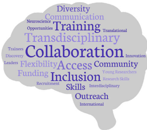
Figure 1: Key areas of discussion in CBRS early career workshops.

psychiatry and neurology, 3 managing unexpected findings in research and clinical medicine that can pose unique human rights challenges, and navigating open science approaches in neurosciences (Canadian Open Neuroscience Platform; comp.ca ) and intellectual protections. 4 All told, for neuroscientists across Canada, both the challenges and opportunities are immense.