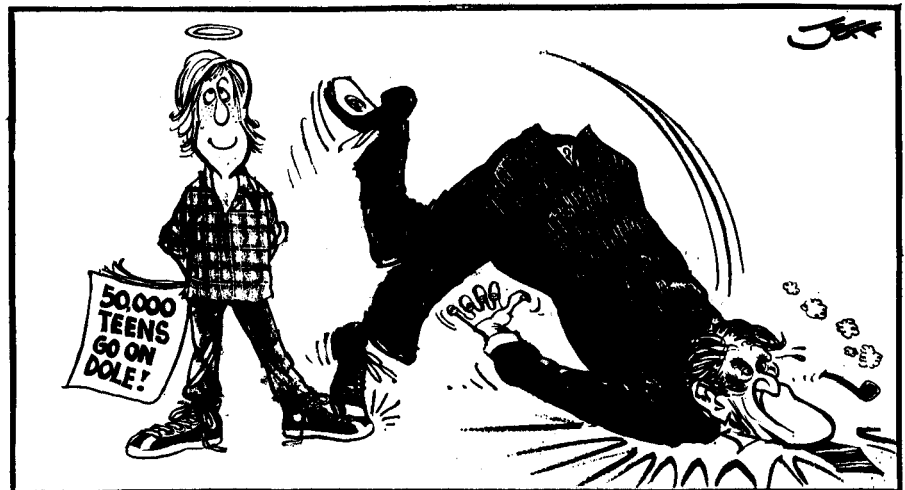
THE AWKWARD YEARS!