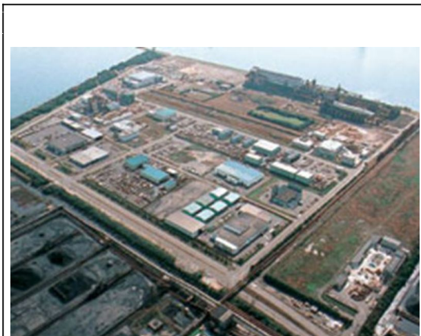
Kitakyushu's eco-town under construction

Recycling Eco-Town: Kitakyushu was selected as one of Japan's first four Eco-Towns in July 1997. Its focus is the facilitation of resource circulation and eco-industries. Resource circulation is connected to the zero emissions concept of taking household and industrial waste and utilizing it as raw materials for other industries. Kitakyushu's Eco Town was designed to create this resource-recycling society and to stimulate the local economy through the growth of these environmental industries. 34 The Kitakyushu Eco-Town project is located in the eastern part of the Hibiki landfill area, which borders the sea. It is made up of the Comprehensive Environmental Industrial Complex (an area for the handling and distribution of recyclables), the Hibiki Recycling Area (business sites for lease to small and medium sized environmental enterprises) and the Practical Research Area (a centre for research and development on environmental technologies). 35