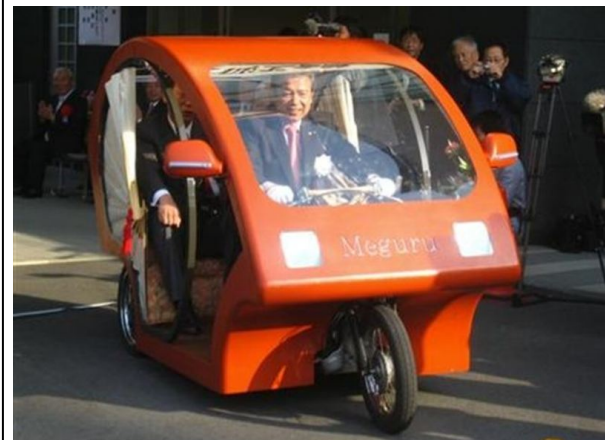
Three wheel electric car unveiled in Osaka, 2010

continued support for the promotion and development of renewable sources of energy and sustainable low energy public infrastructure. Hashimoto, while building his new party to challenge the ruling Democratic Party of Japan has, however, been notably less supportive of the city’s environmental agenda than his predecessors.