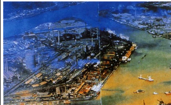
Industrial pollution in Dokai Bay, 1960s

The downside of this industrial activity was rampant air and water pollution problems. Smokestacks belched fumes that came to be known as "the seven colored smoke" due to the black smoke from burning coal, the red from iron oxide and other colors from various fumes. Dokai Bay was so heavily polluted by industrial and domestic waste water that it was nicknamed the "Sea of Death." In fact when, in response to citizen demands, the city conducted the first water quality survey of the bay in 1966, "results of the examination revealed that Dokai Bay could no longer be called 'a sea' because the watercolor was reddish black or yellowish black." 31