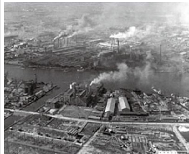
Industrial Osaka, 1955

Beginning in the 1950s and lasting well into the 1970s, Osaka suffered from severe environmental problems.