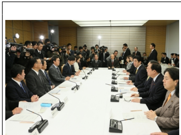
National Resilience Promotion Headquarters: Japanese Cabinet

Resilience Comprehensive Study Commission,” first mooted the idea in the Diet in April of 2012. The plan was then adopted by the party on June 1 of the same year, and submitted to the Diet on June 4 as the “National Resilience Basic Bill.” The LDP also incorporated the National Resilience plan in its campaign platform for the December 4, 2012 election.