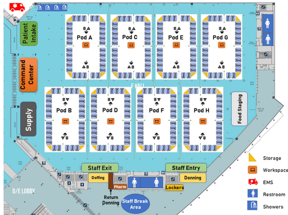
Diagram created by Hockaday et al.

The section of the convention space detailed in Figure 2 was designated as a retrofitted area for donning and doffing of PPE. Preexisting fire exits and restrooms provided a barrier between the 2 points of entry. Three tents were to be constructed: 1 tent at the first entrance (intake donning) and 2 tents at the second entrance (doffing and re-donning). Trained attendants were to be stationed in each tent to assist with donning, redonning, and doffing.