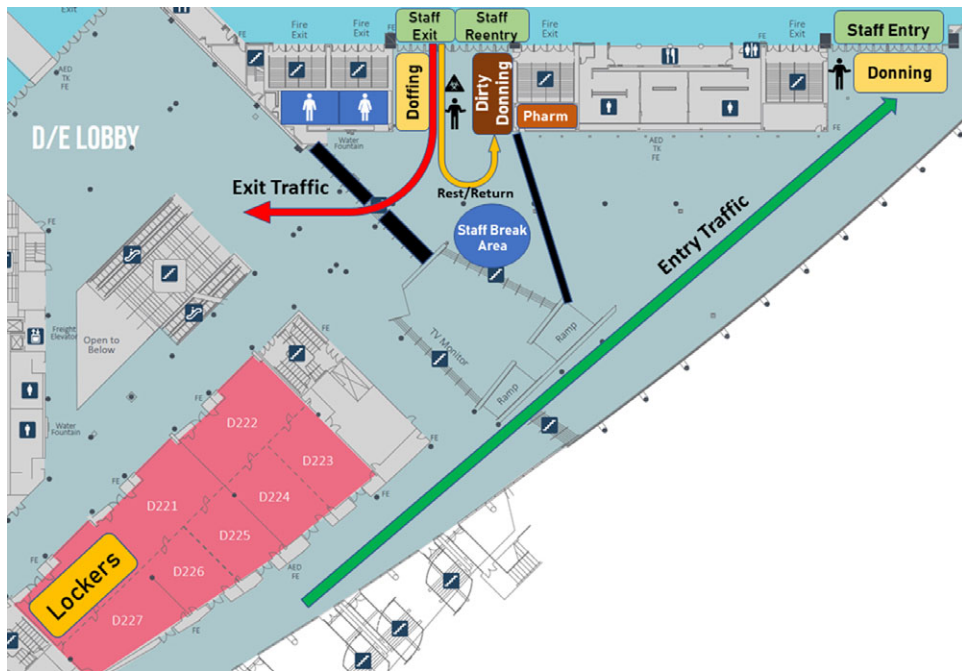
Diagram created by Hockaday et al.

PPE donning and doffing are crucial for infection prevention and maintaining the health of the workforce but can be intimidating and complex to those not familiar with the procedures. Thus, when creating the Federal Medical Station, staff from all levels were recruited to actively participate in the planning,