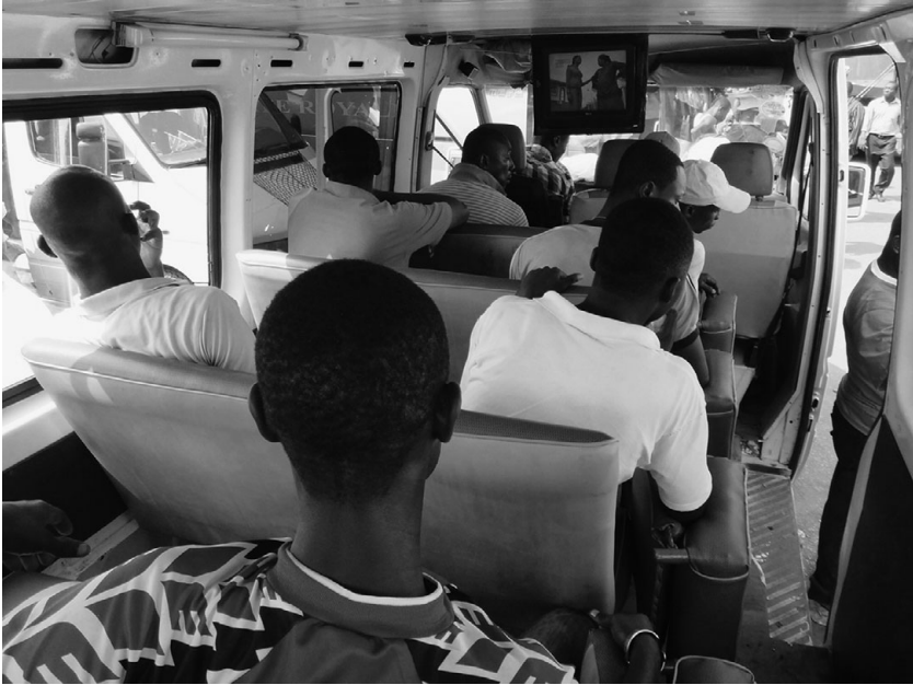
Figure 3.2 On shadowing duty.