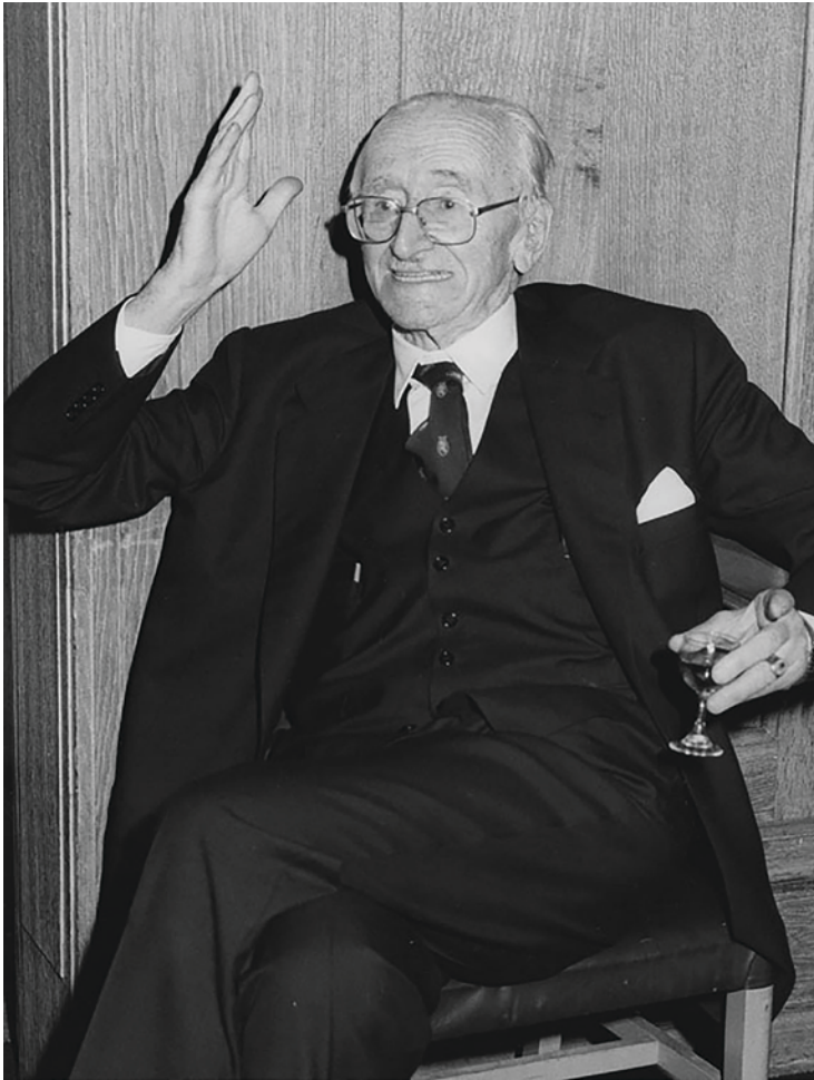
Figure 2. Friedrich August von Hayek, 27 January 1981, the 50th anniversary of his first lecture at LSE.

his contribution to the theory of neural networks. It is well known that the term “performativity” careens across disciplinary boundaries, from linguistics (Austin 1962) and gender (Butler 1988) to the sociology of science (Pickering 1995; Barad 2003; see Salter 2020a; Velten 2012). We situate the performativity of AI, however, in yet another disciplinary framework: that of economics. Described by sociologists, economic philosophers, and political scientists, economic performativity argues that economics is not simply a mathematical description of the world. “[E]conomics, in the broad sense of the term, performs, shapes and formats the economy, rather than observing how it functions” (Callon 1998:2). Yet, economics is not only performative in the material actions produced from its models. According to Michel Callon, economics also creates new kinds of social-technical “arrangements” ( agencement )—experiments carried out “in the wild” of the world (2007:312).