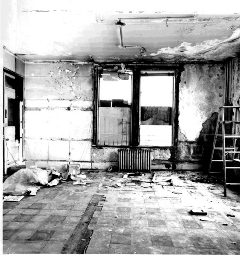
Figure 3 Pier Six at the Boston Harbor.

also query text's 'veiled receiver'. 29 Film is Ronell's preferred exemplar. 30 Disembodied voices might sometimes direct the diegesis by roving, uncanny and horrifying, over telephone lines, but the telephonic aperture also 'makes felt a connection with reception history' that cannot be fully claimed in and as the acousmètre's thingified authority. 31