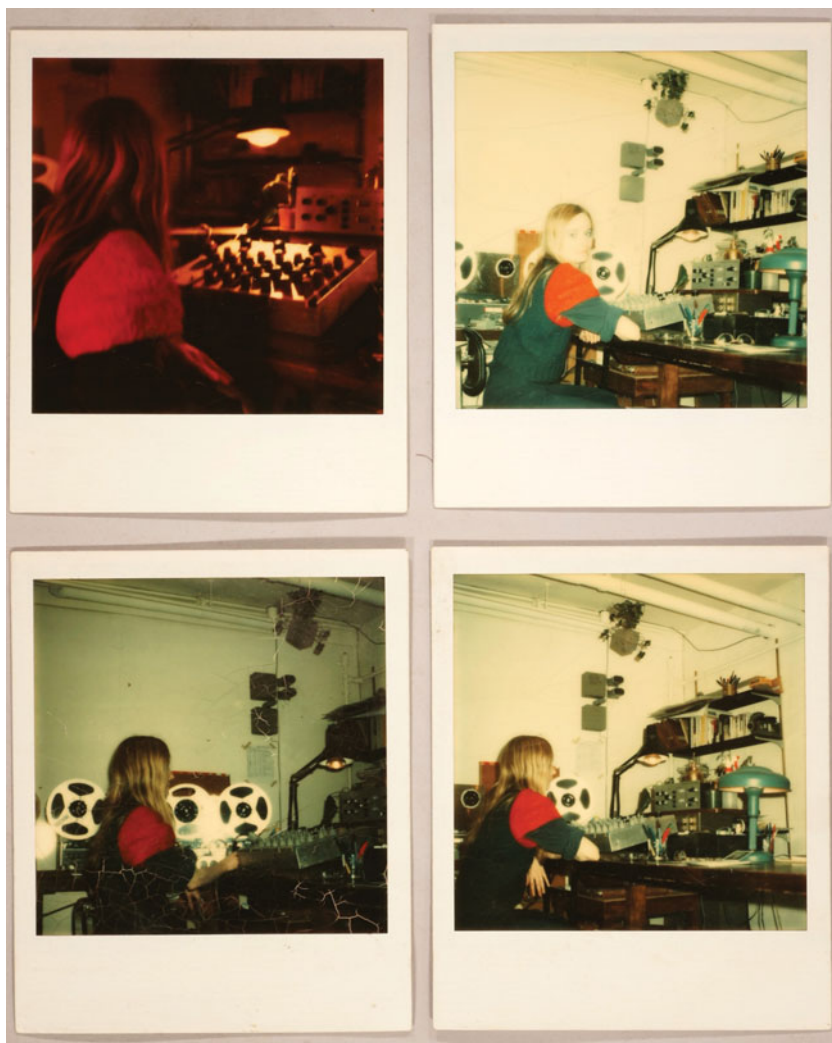
Figure 1 (Colour online) Maryanne Amacher in her Cambridge Studio with phone blocks.

Amacher's Harbor tapes – and other tapes, too, from a series she called 'Life Time and its Music' made during her tenure at SUNY Buffalo as a Creative Associate (1966–7) 1 – criss-crossed the United States between 1967 and 1980 as she developed the twenty-two installations that came to comprise the series City-Links . Each part in the series was a little different. In US cities across the Northeast, Southeast, and Midwest, City-Links's telelinks connected one to as many as eight meticulously placed remote microphones to radio stations, galleries, or museums, where Amacher mixed the live-feeds – sometimes cinched by the Harbor material,