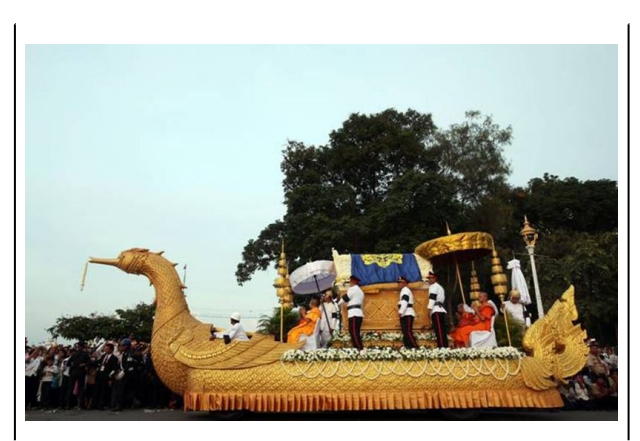
A phoenix float carries the casket of Sihanouk

Undoubtedly the passing of Norodom Sihanouk on October 15, 2012 at the age of 89 after six decades of close involvement in Cambodian politics has served to refocus attention upon the status of the monarchy in that country, facts not diminished by the actual succession in October 2004 to his son Norodom Sihamoni (b. 1953).