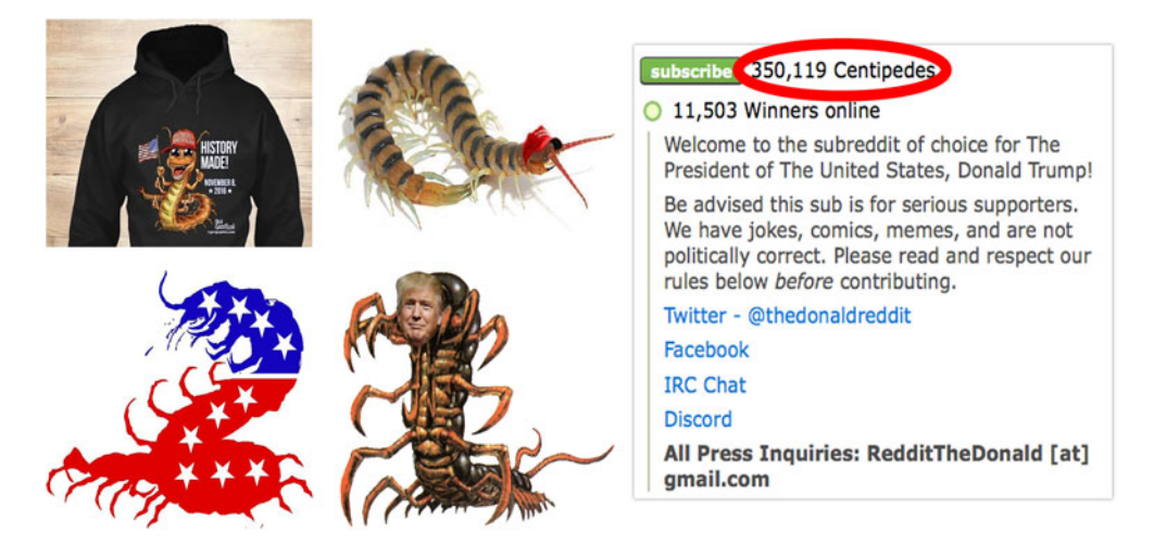
Figure 1 'Centipede'-related content in pro-Trump social web spaces.

words such as 'sick' (as an affirmative term) can therefore cause problems. Overall, although the pilot crawl was revealing, the corpus it returned was found to contain some spam from the period 2008–2010 before the genesis of MLG Montage Parodies. Therefore, an Advanced Boolean crawl was subsequently run using the search string 'MLG Montage Parody'; 'MLG Montage Parodies'; '[MLG]'; 'major league gaming montage parodies'; 'Major League Gaming Montage Parodies'. This resulted in a corpus of 192,789 comments by 192,560 users on 657 videos, with a starting date of January 2013. Mozdeh estimated that 16.8% of the commenters were male (n = 32,323), 5.2% female (n = 10,114), and 78.0% unknown (n = 150,352). The result for this smaller, cleaner set of data was similar: 'donald trump' returned far more matches than 'hillary clinton'. Yet word association tests were even more revealing. The five most common words associated with 'donald trump' were 'president' (10.2%), 'hate' (4.4%), 'wall' (4.2%), 'won' (3.7%), and 'america' (3.5%). The five most common words associated with 'hillary clinton' were 'trump' (18.3%), 'donald' (7.3%), 'bernie' (6.1%), 'president' (6.1%), and 'america' (6.1%).