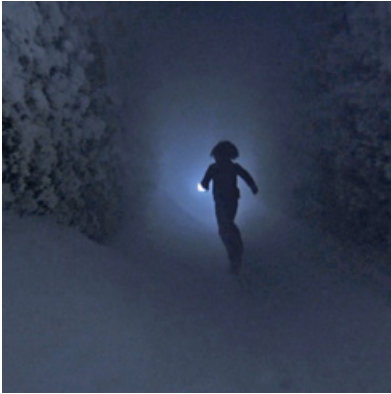
Figure 9 The snow covered hedge maze through which axe-wielding Jack Torrence chases his son