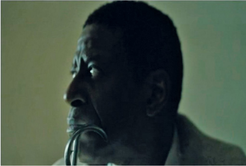
Figure 8 Sherman, frightened by the sound of approaching officers

intimidate Darryl while wearing a uniform that makes him look like an SS officer. 132 The uniform predicts the same craving for violence that Howard reveals in shooting Tommy's father. Later Rick reappears, 'amped up on imagination and anger when he turned the corner, his gun already drawn, looking for something to shoot'. 133 Invariably, Rick shoots Darryl in his own store, acting in a semi-official capacity as a local security guard. Rick's position is important given that he is not sanctioned by state or federal government to act in such a death-dealing capacity. The story, like other BLM Gothic texts, reminds us that, in a country of heavily-armed white citizens taught to devalue Black life, any individual can exercise violent anti-Blackness with a similar level of sanctioning. 134