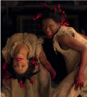
Figure 5 Topsy and Bopsy