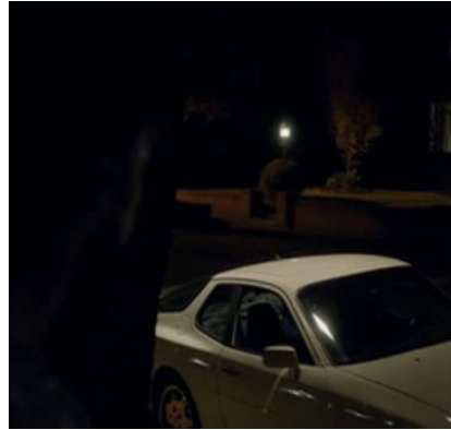
Figure 10 Andre walking through a Whitopia, another kind of dangerous white hedge maze

scene performs BLM Gothic anxieties about whiteness, location, and ownership, revealing how Black ‘anxieties [are] about the people who “own” the land. For they are the ones who enslaved, brutalized, and exploited Blacks (and other people of color) with the distinct goal of profiting off of the crops produced on “their” property’. 156 In BLM Gothic, whites continue to consume and profit from Black people who are treated as property to be claimed and dispensed at white leisure. The texts point to the horrific history underpinning Whitopias and mark the ways they remain traps to ensnare even wary Black travelers. Whereas white-centred Horror films of the late twentieth-century marked the Black urban area as one in which ‘the innocent, those who could not get out, were held hostage’, 157 BLM Gothic marks Whitopias as spaces in which innocent Blacks cannot get out and are not only held hostage but consumed and destroyed.