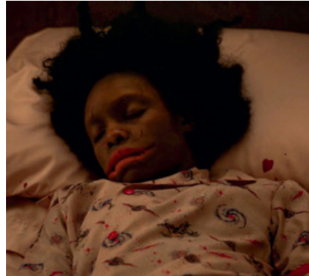
Figure 6 Dee, possessed by Topsy and Bopsy

the two spectres are barely human. Their appearance stands in for the monstrosity of Till's corpse. Dee flees from figures signifying warping stereotypes of Blackness as well as physical assaults that warp Black bodies in death (Figure 6). The stereotype of Black savagery is marked as productive of death through the episode's symbology and turn to an actual historical event.