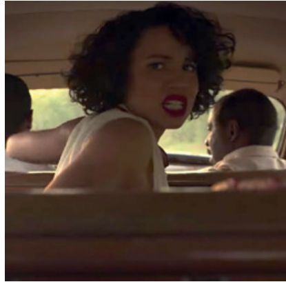
Figure 12 Leti watches in terror as they are pursued by the white officer

that wad of money, well, he'd be fortunate if the police were called. They might only beat him, then take him to jail. Much worse would happen if he got snatched by a mob. 160