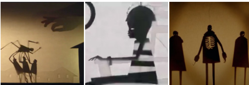
Figure 7 Shadow puppets from Candyman (2021) end credits

Destroyer and ‘Haint in the Window’ similarly gesture to this sense of fate. Jo, in recounting her life with Akai from his infancy to his preteen years to the