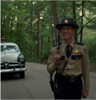
Figure 11 A white officer threatens Atticus and friends to get out of town before sunset