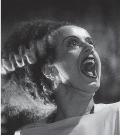
Figure 17 The Bride from James Whales's The Bride of Frankenstein (1935)