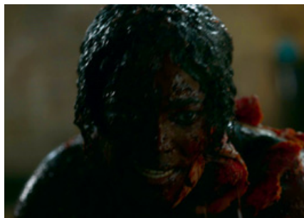
Figure 13 Ruby transforming back into her Black body while attacking her manager