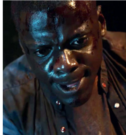
Figure 16 Chris's conflicted face just before he let's go of Rose's throat

illogical, (self-)destructive drive which is never fully explained. While Jo reproduces, to an extent, her ancestor Victor's madness, her drive for vengeance, power, and control of death is always couched in terms of her grief. Further, the series' consistent accounts of Jo's attempts to fight for progress through socially acceptable means only to continually confront systemic oppression clarify her determination to destroy the system that has tested her for too long. Her outlash signifies the "cleansing" conditions of violence 185 which Afropessimism defines as key for the Black theorist and Black theory if they are to truly disrupt systemic anti-Blackness and access full personhood. 186