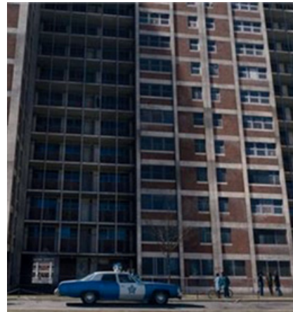
Figure 4 Police cars outside of Cabrini Green tenement

location the entire time. Burke's narration explains that the officers suspected someone in Cabrini Green was responsible for putting razors into children's Halloween candy in a white neighbourhood. The officers beat Sherman to death; yet a couple weeks later, more razor blades appear in the candy of white children. What the film does not say but makes implicit is the illogic of suspecting that anyone in the ghetto would be responsible for the crime. The white victims would have lived in neighbourhoods inaccessible to the impoverished Black populace. The police surveillance and excessive number of officers who arrive to 'detain' Sherman point to a predetermined idea of the ghetto and its populace as savage monsters.