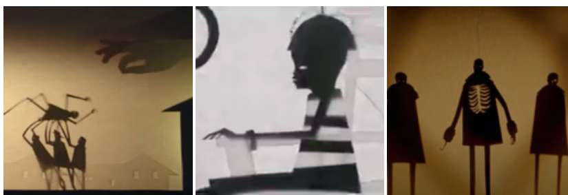
Figure 7 Shadow puppets from Candyman (2021) end credits

Destroyer and ‘Haint in the Window’ similarly gesture to this sense of fate. Jo, in recounting her life with Akai from his infancy to his preteen years to the