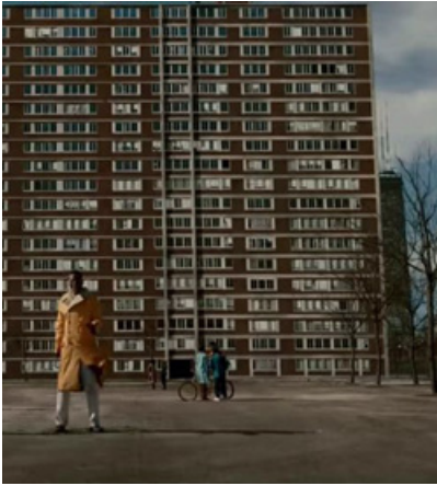
Figure 3 Sherman Fields in front of Cabrini Green