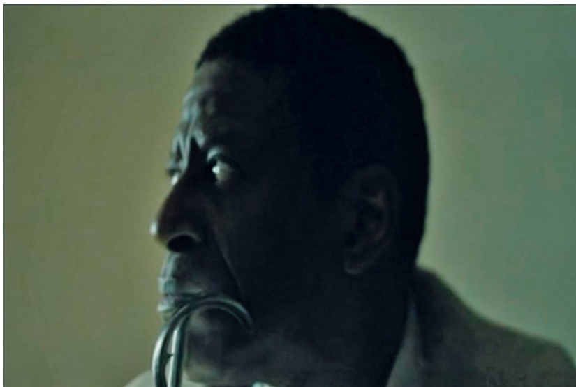
Figure 8 Sherman, frightened by the sound of approaching officers

intimidate Darryl while wearing a uniform that makes him look like an SS officer. 132 The uniform predicts the same craving for violence that Howard reveals in shooting Tommy's father. Later Rick reappears, 'amped up on imagination and anger when he turned the corner, his gun already drawn, looking for something to shoot'. 133 Invariably, Rick shoots Darryl in his own store, acting in a semi-official capacity as a local security guard. Rick's position is important given that he is not sanctioned by state or federal government to act in such a death-dealing capacity. The story, like other BLM Gothic texts, reminds us that, in a country of heavily-armed white citizens taught to devalue Black life, any individual can exercise violent anti-Blackness with a similar level of sanctioning. 134