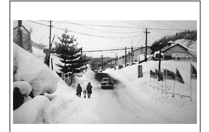
High-school Avenue (Kōkō Dōri), which the students ascended and descended every day

SM In Utashinai, the mines was the only employers. There wasn't even a farmers' union. All the students' families were miners. It was a closed shop, and everybody belonged to the union. It was the kind of place where, when we teachers went on strike, the students would call out from the windows, "Sensei, gambare!"