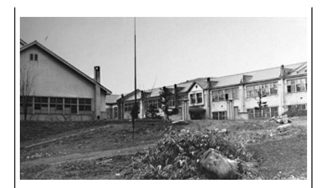
Utashinai High School, mid 1950s-1960s

At the end of vacation, I learned on the ferry back to Hakodate that there'd been a fire, and the house where I boarded had burnt down. I'd left most of my things there—the good suits, the bedding. Everything was gone. I announced that I was resigning and going back to Yoichi.