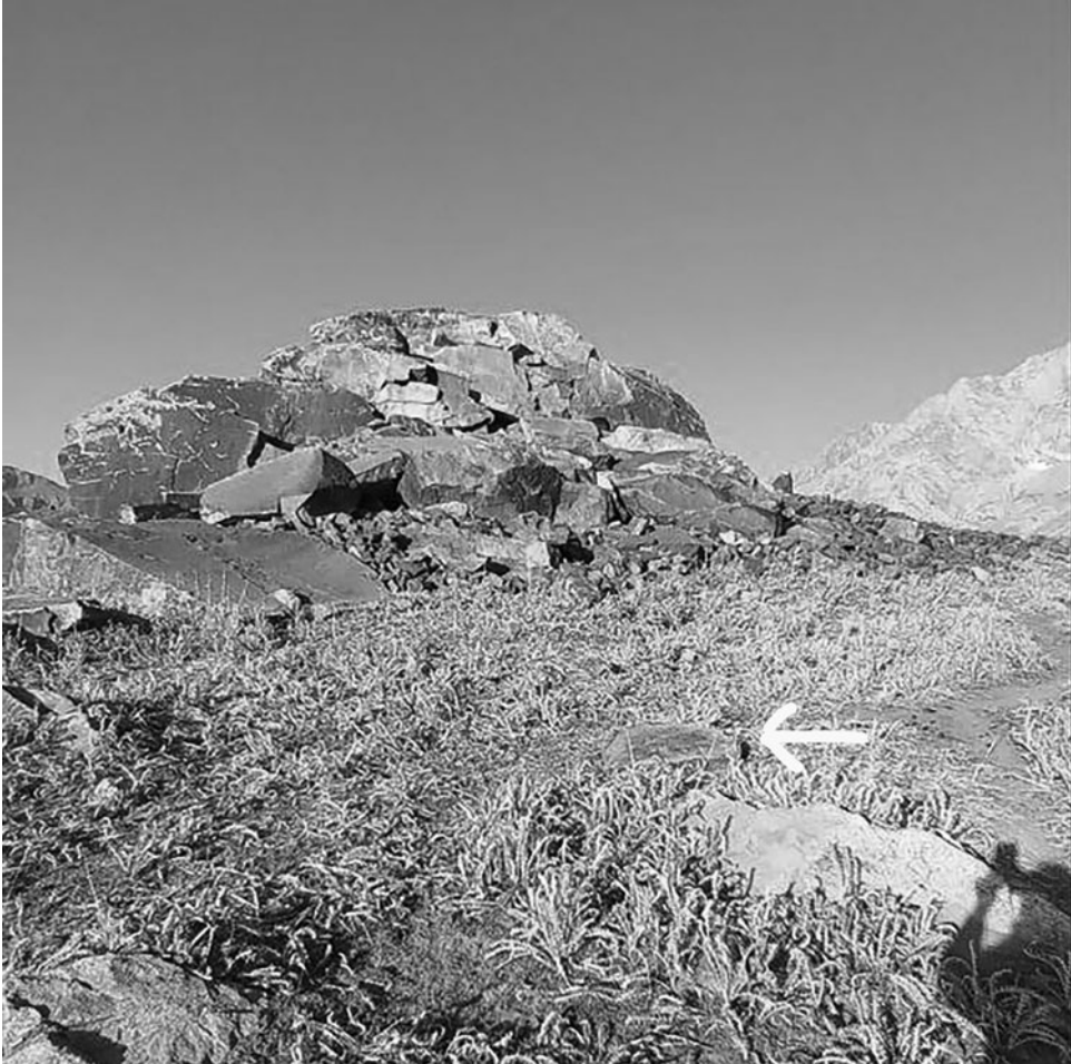
Figure 4. The first and largest rocky outcrop with the first inscription in the unknown script and from which the Bactrian Kushan inscription (as indicated by the arrow) had broken and fallen.

In October, the National Museum also shared the images with the Afghan scholar, Davary, and he has since published a booklet on the inscriptions. 6 He repeated the Bactrian reading provided earlier to the Museum, but misreading some of the letters and suggesting that the Bactrian text contained scribal mistakes or represented a variant dialect.