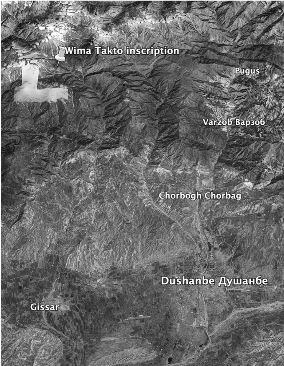
Figure 1. Location (top-left) of the new inscriptions, north-west of Dushanbe.