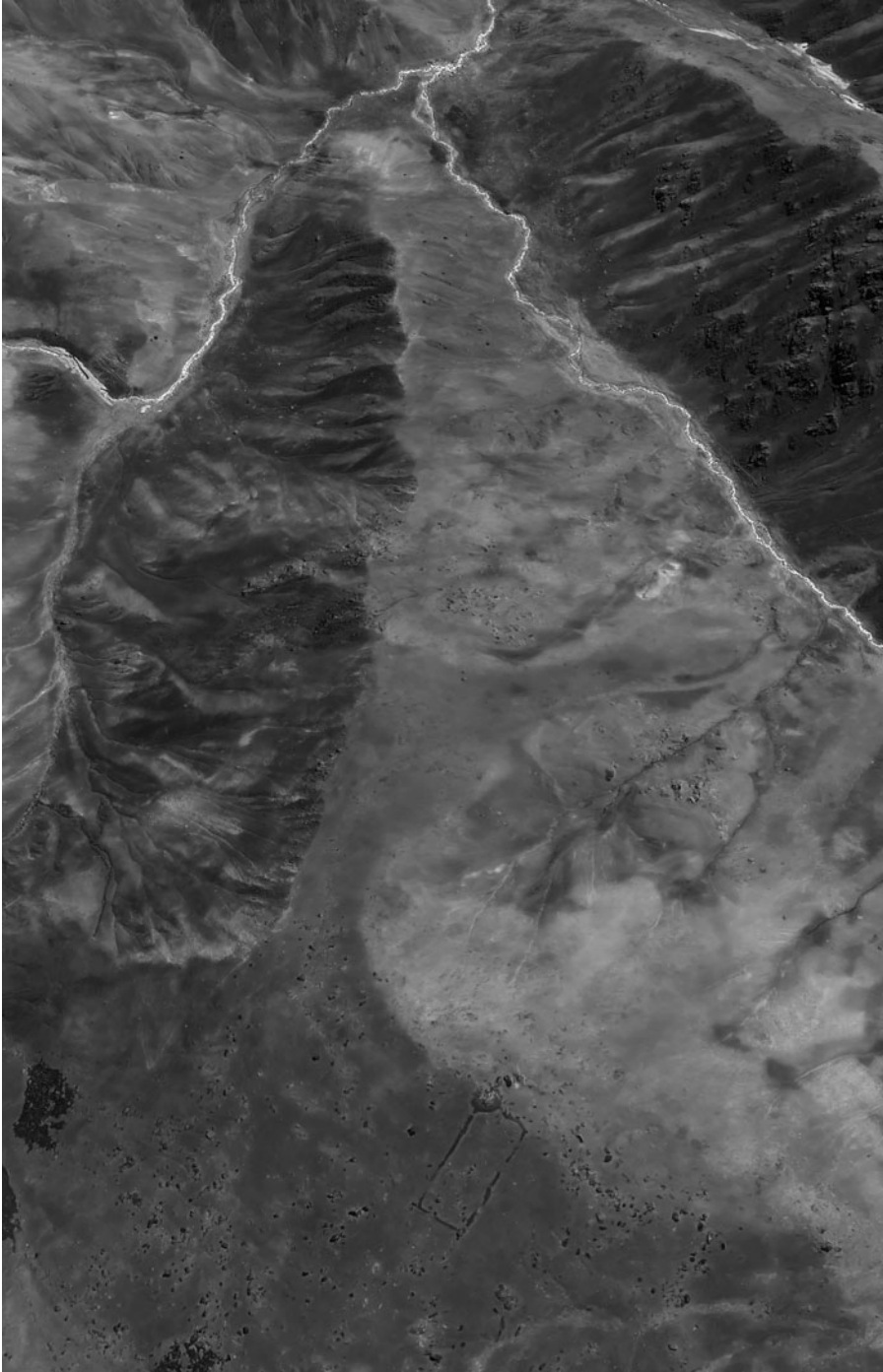
Figure 2. The site of the enclosure (bottom-centre) to which the larger rocky outcrop with inscriptions was adjoined on a promontory above a confluence of the Khanaka River and one of its tributaries.