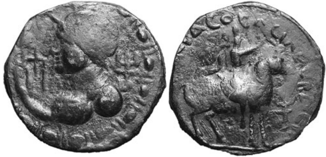
Figure 11. Coin of Wima Takto, Soter Megas type for Bactria, inscribed with his initial vi in Kharoṣṭhī on obverse and Greek O at end of reverse inscription ΒΑΣΙΛΕΥ ΒΑΣΙΛ[ΕΩΝ ΣΩΤΗΡ ΜΕ]ΓΑΣ Ο.