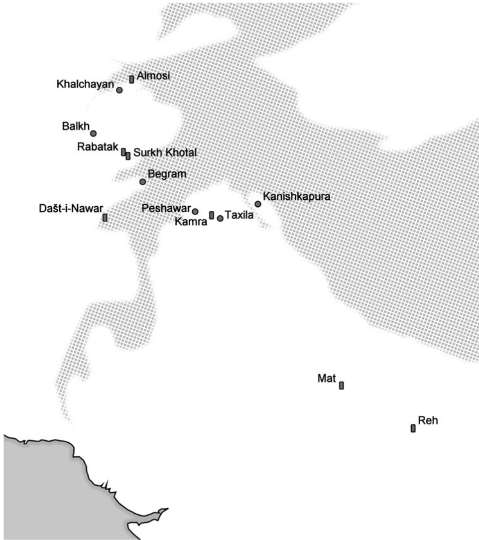
Figure 8. Map of territory included in the Kushan empire showing locations of Kushan-related sites (●) and Kushan royal inscriptions (■).

Wima Takto (Figure 10). The coin and Mathura enthroned representations of Wima Takto also recall two other images of enthroned early Kushan kings at Surkh Kotal 33 and Khalchayan (Pugachenkova 1971, fig. 54), 34 suggesting that they may also be images of this king.