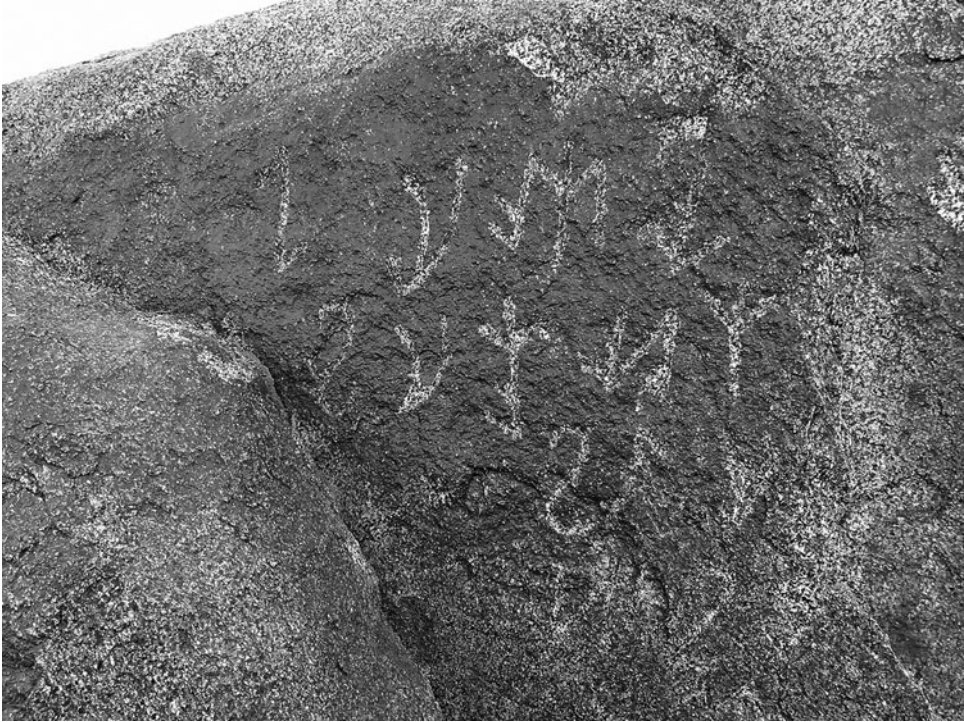
Figure 7. The first part of the second inscription in an unknown script.

began to work on the new inscription in the ‘unknown script’ and, at a conference on the new inscriptions held in Tajikistan on 1 March 2023, they announced their findings, characterising the script in the same way as Lurje but offering a key to the script that enabled them to recognise parallels in the script on the large rocky outcrop (Figure 5) with the royal name and title in the Bactrian inscription. The Cologne team had been interrogating the ‘unknown script’ since May 2021, when they started work on the Dašt-i-Nawar inscription and its cognates. This previous engagement enabled them to rapidly identify the language of the inscription as a previously unknown Middle Iranian language, related to but different from Bactrian. 9 They also showed that the same name and title together with the word Kushan could also be read in the ‘unknown script’ at Dašt-i-Nawar and recognised further titles of the king in the previously unrecorded Middle Iranian language paralleling those in the Bactrian text of the Dašt-i-Nawar inscription. The relationship between Bactrian and the language of the ‘unknown script’ proposed by Bonmann, Halfmann, and Korobzow is also evident in the solution proposed by Harry Falk, 10 based on his reading of Davary’s article, that the ‘unknown script’ is a transcription of the Bactrian.