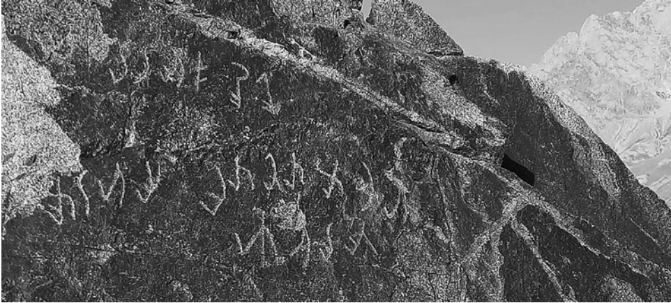
Figure 5. The inscription in an unknown script on the first rocky outcrop.