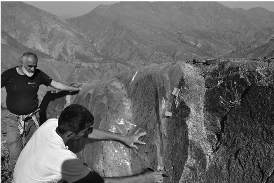
Figure 6. The National Museum of Tajikistan team documenting the inscriptions in an unknown script on the second rocky outcrop.

by other sites and was also published online with an English translation by Central Asian Archaeological Landscapes. 8