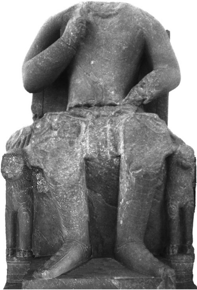
Figure 10. Inscribed image of Wima Takto enthroned, Government Museum, Mathura (still labelled Wima Kadphises).

Wima Takto on some of the coins mentioned above and in the inscription at Mathura, but identified them as references to Wima Kadphises, and attributed the Soter Megas coinage to him too. 39 Fussman also rejected Sims-Williams's reading 40 and doubted the reading of Wima Takto's name in the inscriptions at Mathura and at Dašt-i-Nawar. 41 He discounted including the Soter Megas coinage as relating to Wima Takto, attributing it instead to a usurper who interrupted Kushan rule between Kujula Kadphises and Wima Kadphises. 42 MacDowall used Mukherjee and Fussman's analyses to cast doubt on the reading of Wima Takto's name in the Rabatak inscription and followed Fussman in casting doubt on the presence of his name in the inscriptions at Dašt-i-Nawar and Mathura. 43 He also abandoned his earlier suggestion that there was a Kushan ruler in between Kujula Kadphises and his grandson, Wima Kadphises, suggesting that the Soter Megas coinage should be attributed to the former and the bull-camel coins naming Wima Takto to the