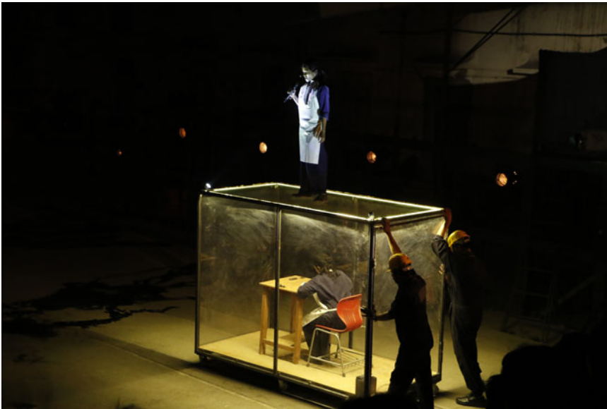
FIG. 3 A large object for a small action.