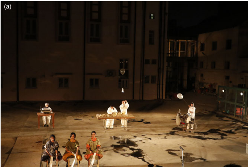
FIG. 5A Alignment.