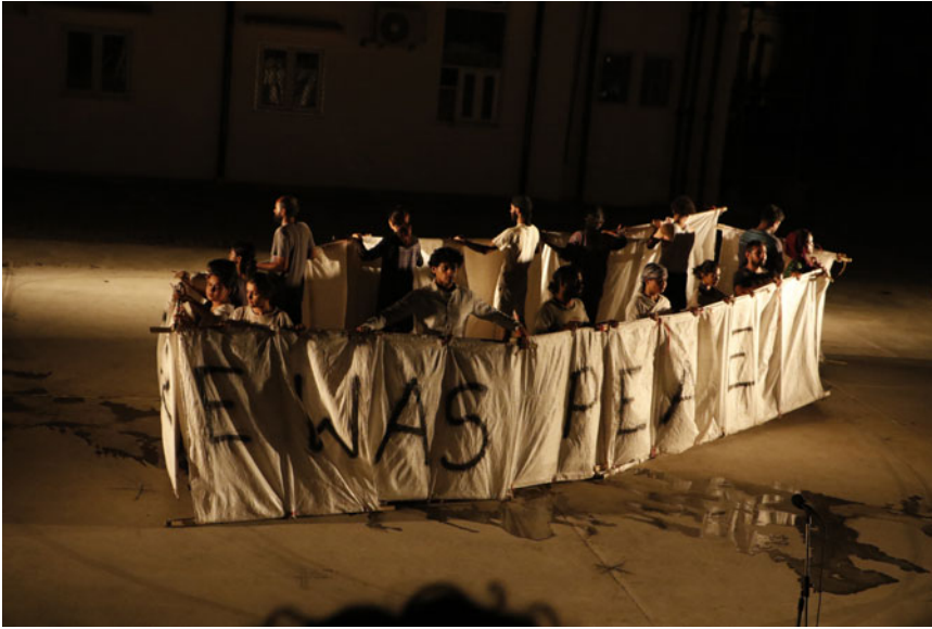
FIG. 1C A dinghy floating on water.

Tents: makeshift shelters that house millions today: those displaced by wars and violence, climate disasters, hunger and unemployment, and urban rebuilds.