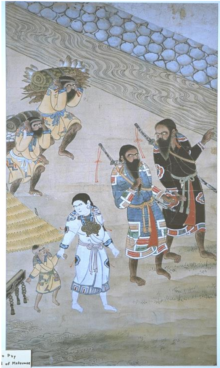
Ainu group in a Japanese representation in Edo

Thus the territorial expropriation of, and assimilationist policy towards, the Ainu was rationalized through this term “opening,” which in turn rested on two of the major ideological