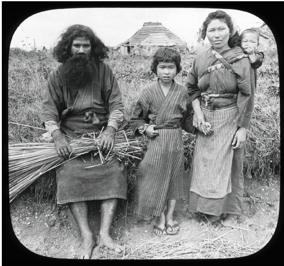
Ainu family, 1906

Seen in this way, we can understand that the discourse of “opening” operates as a universalistic expression of the ethnic enterprise and its progressiveness. A society like that of the Ainu, possessing neither the form of the nation-state nor the structure of capitalism, is thus posited as an ethnicity which utterly lacks the ability to manage itself, to say nothing of the ability to “open” frontiers. It is the “undeveloped” or “childlike” remnant left behind by the historical law of “progress,” one whose only option is to survive through the leadership and patronage of a more “progressive” ethnicity. Consequently, historicism and ethnocentrism resolve themselves in reducing the rich historical experience of mankind to the binary structure of “progress or stagnation,” and each ethnicity is thereby rewritten into a narrative of its oscillating rise and fall.