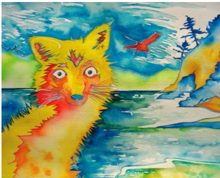
Representation of Chiri Yukie's "Fox's Song"