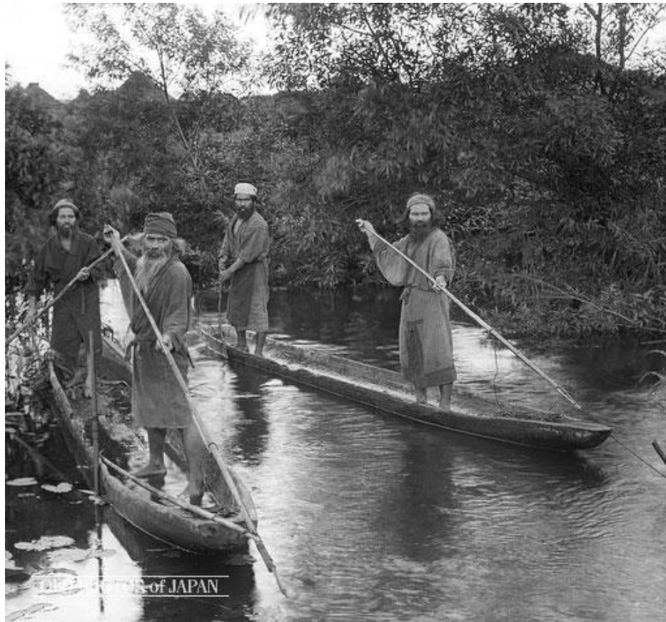
Ainu fishermen c. 1900