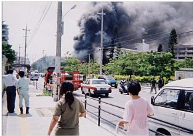
Toxic smoke blazes from the wreckage

In August 2004, on Friday the 13th, a helicopter from the US Marine Air Station at Futenma smashed into the side of a building inside Okinawa International University, fell to the ground, exploded, and burned.