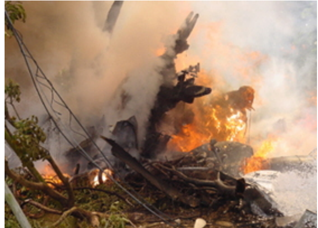
CH-53 in flames

Miraculously, no one other than the crew was injured. But what happened afterward was just as extraordinary.