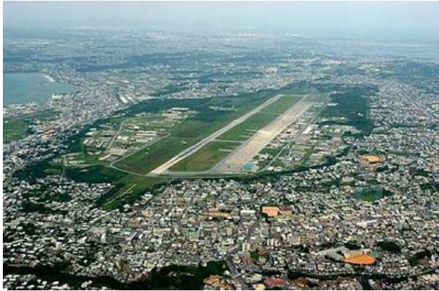
Futenma base in the middle of Ginowan City

In August 2004, on Friday the 13th, a helicopter from the US Marine Air Station at Futenma smashed into the side of a building inside Okinawa International University, fell to the ground, exploded, and burned.