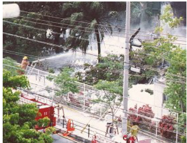
Ginowan City firefighters on the scene

Immediately, scores of Marines came pouring over the fence (the base and the university are back-to-back), and occupied the university. They set up a cordon of yellow tape around the accident site, and kicked out not only reporters and cameramen, but also the Okinawan firemen who had come to put out the blaze, the local police who had come to investigate the cause of the accident, and even the mayor of the town.