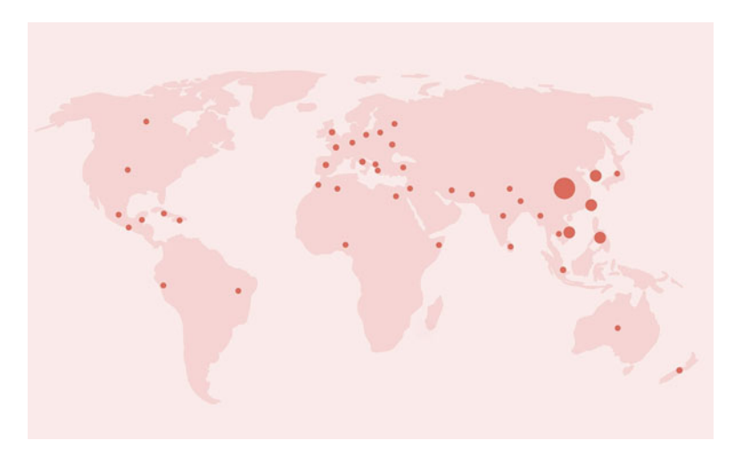
Figure 3. Distribution of sending places in included citations.