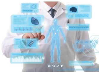
Table of Contents • Table des matières