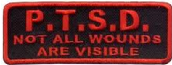
Shoulder Patch Capturing the Paranoia about "Hidden" War-wounds.