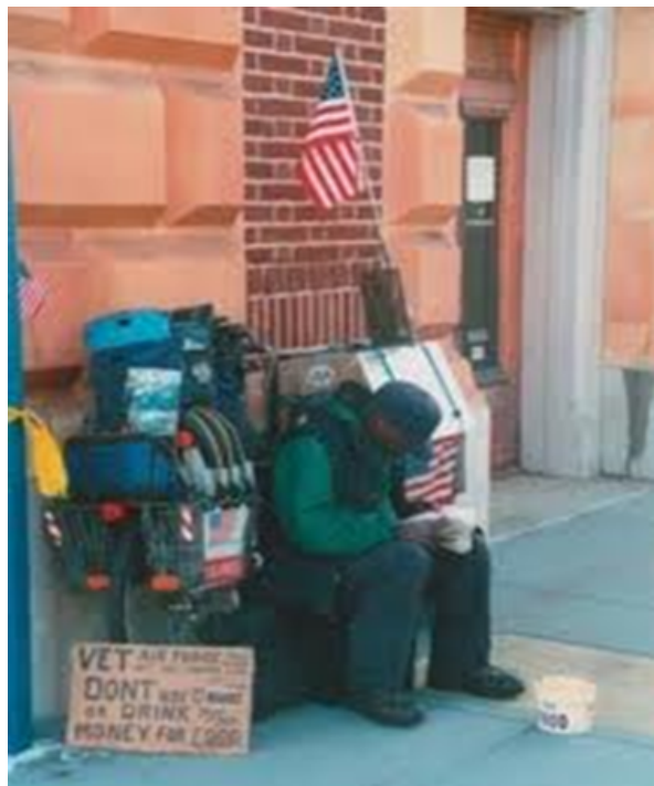
A Street Person Presenting Himself as a Down-and-Out Veteran

The rebel GIs and veterans that appeared on front pages and television news coverage in the early 1970s would be “forgotten,” pushed out of memory by images of “good” veterans befitting the GI Joe figures loyal to their mission and nation born out of World War II lore. 16 The existence of “good” veterans was largely conjured out of the myth that “bad” anti-war activists had been hostile to Vietnam returnees, even spitting on them; the good-bad binary of that myth suggested that the existential badness of spitters implied the goodness of their targets. 17 Further, the alleged trauma of the homecoming experience for “good” veterans was the stimulus for the victim-veteran narrative that underwrote the diagnostic nomenclature of PTSD. The conflation of normative “goodness” and mental-emotional pathology thereby completed the construction of a more comfortable idiom for remembrance of Vietnam veterans than that of VVAW. 18