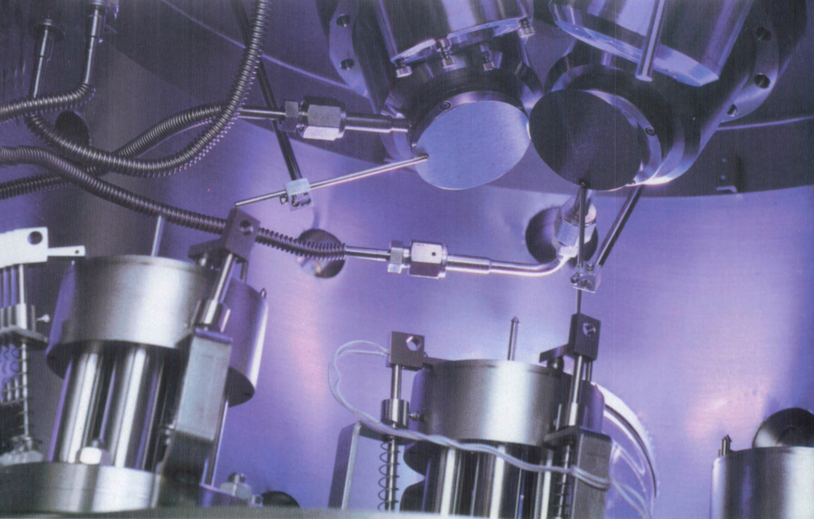
▲ A typical UHV internal arrangement for co-sputtering.