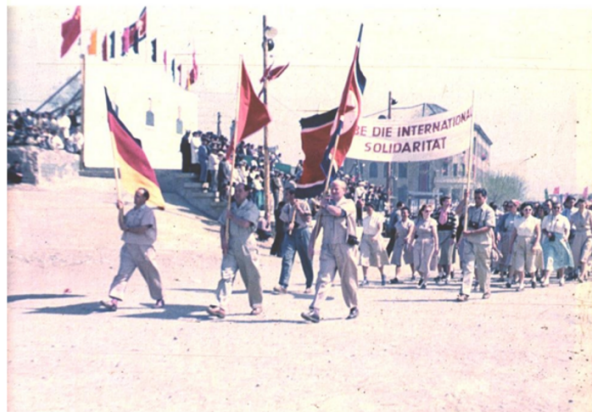
East German engineers and their families in Hamhung, celebrating the 10th anniversary of the founding of the DPRK, 1958.

In just over five years, North Koreans with East German assistance rebuilt Hamhung as a modern industrial city, and for decades the city would be the main industrial hub of North Korea outside the capital Pyongyang. In 1960 – long before the term would be applied to South Korea – the East German press called North Korea “an economic miracle in the Far East.” 14 In June 1956, Kim Il Sung visited the GDR and personally thanked the East Germans for their help. 15 But from the beginning of the reconstruction process, the DPRK leadership had seen foreign assistance as a limited process that would gradually give way to North Korean self-reliance. 16 In December 1955 Kim made his subsequently famous speech about “Juche” or self-reliance, Originally referring to ideological independence, especially with regard to the Soviet Union, over the course of the next two decades Juche would be extended to all aspects of North Korean behavior, from politics to economics to military defense.