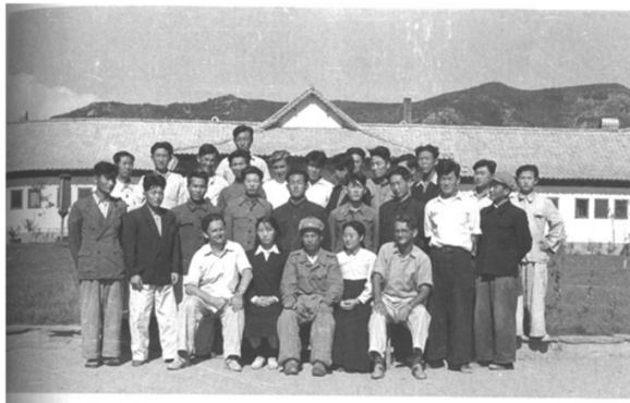
Korean and German workers in the Hamhung reconstruction project, late 1950s.

promise given by you, dear comrade Prime Minister, to our delegation at the Geneva Conference, to rebuild one of the destroyed towns by the efforts of the German Democratic Republic...The government of our Republic has decided as the object of reconstruction and recovery by your government the city of Hamhŭng, one of the provincial centers of our Republic. 13