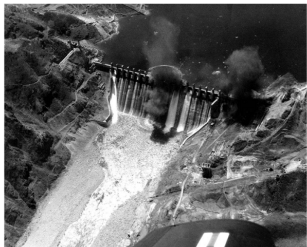
Aerial bombardment of Hwachon Dam.

1950 and 1951. To escape the bombing, entire factories were moved underground, along with schools, hospitals, government offices, and much of the population. Agriculture was devastated, and famine loomed. Peasants hid underground during the day and came out to farm at night. Destruction of livestock, shortages of seed, farm tools, and fertilizer, and loss of manpower reduced agricultural production to the level of bare subsistence at best. The Nodong Sinmun newspaper referred to 1951 as "the year of unbearable trials," a phrase revived in the famine years of the 1990s. 9 Worse was yet to come. By the fall of 1952, there were no effective targets left for US planes to hit. Every significant town, city and industrial area in North Korea had already been bombed. In the spring of 1953, the Air Force targeted irrigation dams on the Yalu River, both to destroy the North Korean rice crop and to pressure the Chinese, who would have to supply more food aid to the North. Five reservoirs were hit, flooding thousands of acres of farmland, inundating whole towns and laying waste to the essential food source for millions of North Koreans. 10 Only emergency assistance from China, the USSR, and other socialist countries prevented widespread famine.