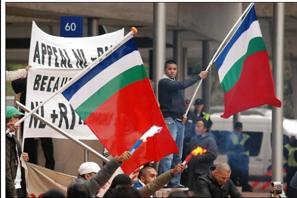
RMS flags in the Netherlands, 2011, home to the South Moluccan government in exile

given sanctuary in the Netherlands in the aftermath of the rebellion's failure, from where they continue to agitate for an independent homeland.