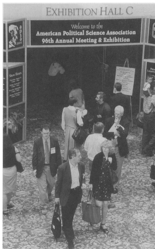
Hot Type. Attendees leave the exhibition hall which featured 159 booths.

Planning for the 2001 Meeting in San Francisco is well underway and the headquarters hotels are the Hilton San Francisco, the Renaissance Parc Fifty-Five, and the Hotel Nikko San Francisco. The 2001 Call for Papers was issued during the fall and the deadline for submitting proposals passed on November 15. Look to APSA's web site ( www.apsanet.org ) regularly as information on meeting highlights, registration, and hotel reservations will soon appear.