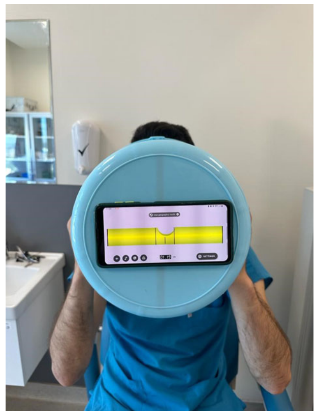
Figure 1. The smartphone-assisted modified bucket test.

Vertigo dizziness imbalance scores and subjective visual vertical deviations were compared between patients with and without BPPV using an independent sample t -test. Paired t -tests were utilised for other assessments. Statistical analyses were