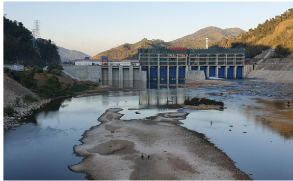
The Nam Ou 1 is the last in a seven-dam cascade being built along this tributary of the Mekong by China’s Sinohydro Corporation

“The Nam Ou dams are the worst built in all of Southeast Asia, not just the Mekong basin. [They] have zero environmental mitigation built into their design – no fish passage, no sediment gate,” Eyler says.