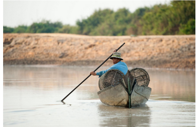
Fishing on Tonle Sap Lake, Cambodia

The Use and Construction of Dams on the Mekong will Determine the Future of Southeast Asia's Largest Lake