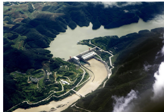
Jinghong hydropower station on the Lancang River in China

more mega-dams on the Lancang, which comprises more than half of the sediment crucial to the Mekong's ecology. The northernmost of the dams is Yunnan's 990-megawatt Wunonglong Dam high in the Himalayas of the Diqing Tibetan Autonomous Prefecture, which was completed in 2019. They continue down to Jinghong near the lush forests of Xishuangbanna. More dams are planned even closer to the Thai border at Ganlanba and Mengsong.