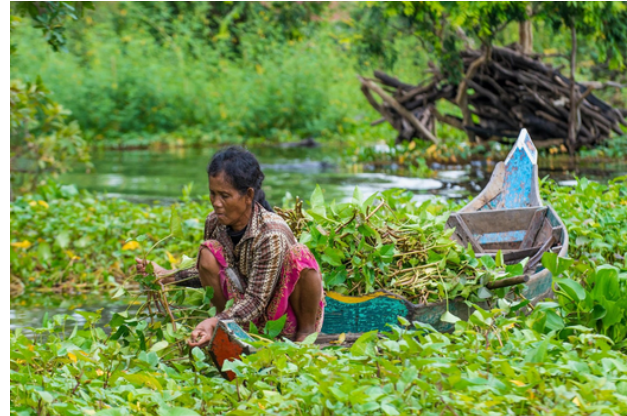
Collecting water hyacinths on Tonle Sap Lake