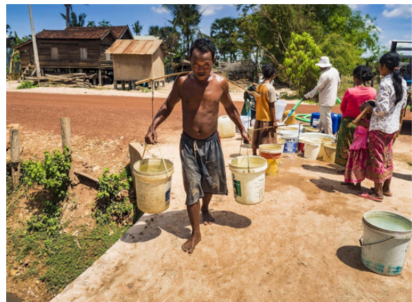
Collecting water in Sot Nikum village near Siem Reap. During the recent extreme droughts, residents relied on water supplied by NGOs or bought from sellers.

“The last 12 months have shown more symptoms of what has been predicted for the river’s ecological tipping point,” Eyler says. “There are those who say the present number of dams could cause the Tonle Sap’s expansion to not happen. Sediment removal from sand mining in Cambodia and Laos also has an impact.”