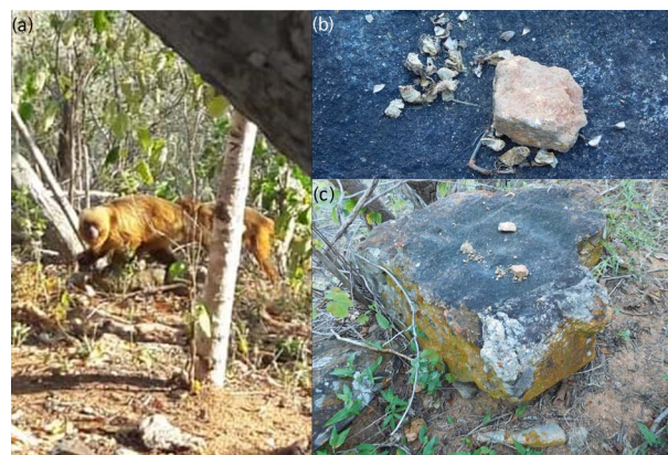
PLATE 1 Blonde capuchin monkeys Sapajus flavius moving on the ground in the Caatinga biome of north-east Brazil (a), along with evidence of their use of hammer and anvil stone tools for opening Manihot epruinosa seeds (b), in the site denominated as ‘tool use sites’ (c).

The first phase of the survey was conducted in July–December 2019 when a group was monitored for 7 days per month. Although other species of capuchin monkeys are known to use tools (e.g. Sapajus libidinosus ; Fragaszy et al., 2004, American Journal of Primatology , 64, 359–366), this behaviour has not been reported previously for the blonde capuchin monkey in the Atlantic Forest. In the Caatinga, we observed sites with evidence of the use of stones for cracking nuts of Manihot epruinosa (Euphorbiaceae). Small stones were used as a hammer on larger anvil stones, and we found evidence of food items processed by this method (Plate 1). We also observed the