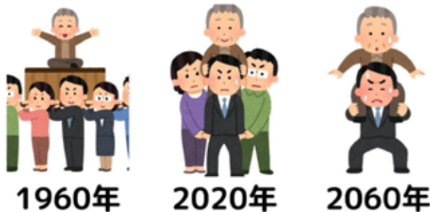
Image 3.