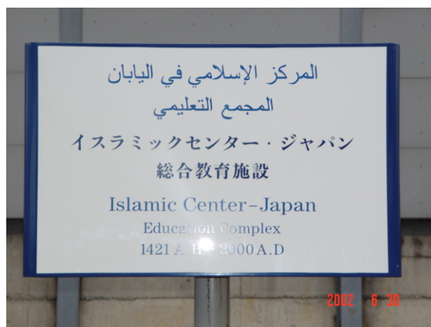
Islamic Center of Japan