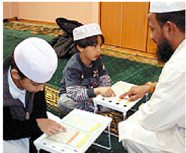
Children learn Arabic at the Yokohama Mosque

At the mosque in Ebina, Kanagawa Prefecture, about 10 children around age 10 are learning the Arabic alphabet. Every day from 4 pm to 8 pm, the mosque holds Koran classes. They started last November, at the urging of Pakistani and Bangladeshi Muslims living in the area who wanted their children to be properly versed in the ancestral religion and the Arabic language. The classes are taught by the parents themselves.