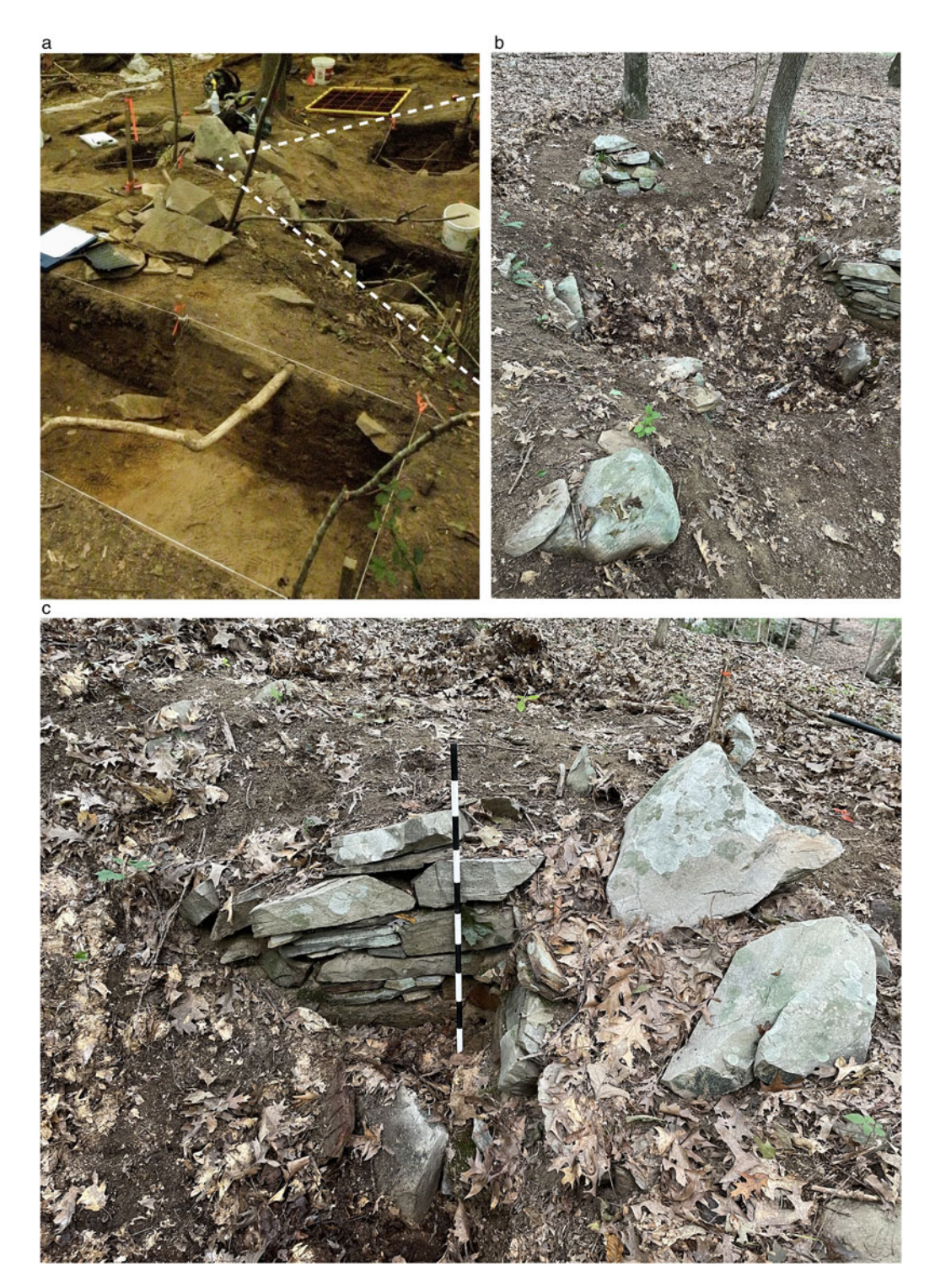
Figure 2. The Hillside Site foundation: (a) Hillside Site excavations, looking north; dotted line marks approximate foundation outline; (b) Hillside Site foundation, looking east; (c) Hillside Site foundation, southeastern corner. (Color online)