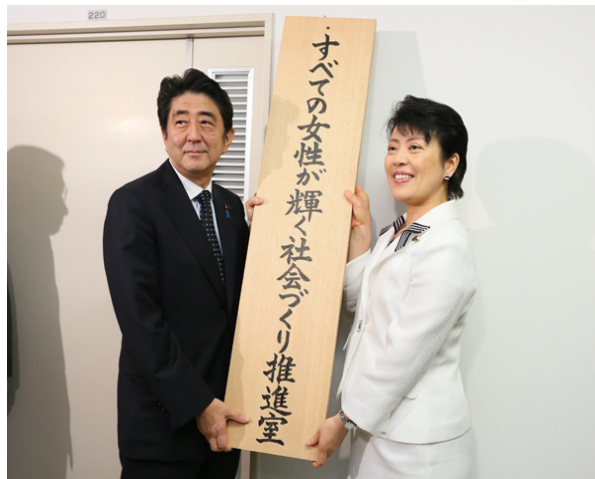
Establishment of “office for the encouragement of building a society in which all women shine,” 2014

Moreover, NK’s willful disregard of equality between women and men is in opposition to international conventions and remedial actions for gender equality (e.g., the Convention on the Elimination of All Forms of Discrimination against Women - CEDAW). NK’s obsolete traditional model of family fails to keep up with women’s diverse lifestyles, families, and work styles, and does not accommodate them with viable options. On the contrary, women are roundly penalized in various forms if they do not comply with or fit the NK/LDP model of family functioning and of women’s roles. Consider the facts that “about 1 in 3 women in Japan aged between 20 and 64 who live alone are living in poverty.” 83 54.6% of single parent/lone adult (overwhelmingly mothers) households containing one or more children is considered poor, living on less than half of median income. 84 Note, too, the gender disparity found in the womenomics initiative to promote women’s advancement and empowerment in the business world under Abenomics. In the Gender Equality Bureau Cabinet Office, there is not a single woman in the photo of “a group of male leaders who will create a society in which women shine.” 85 It will