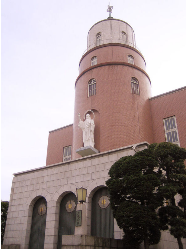
Seicho no ie

Nippon Kaigi was established in 1997 through integration of two existing groups. One was Nihon o mamoru kai (Society for the Protection of Japan) founded in 1974. The other was Nihon o mamoru kokumin kaigi (People's Conference/National Conference to Protect Japan) founded in 1981).