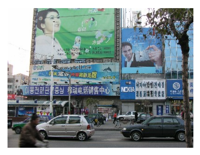
Street in Yanji, the capital of Yanbian

China's coastal regions have received impressive financial and organizational resources through overseas Chinese networks and international capital generally. China's land borders are also linked to transnational communities, thanks to the networks of ethnic minorities who live there. This article introduces the mobilization of the Korean minority's transnational ethnicities in the service of local economic development. China's well-established structure for the utilization of overseas Chinese resources serves as a frame of reference. The analysis focuses on foreign investment, donations, and remittances—resources that are widely regarded as the most important development input provided by the overseas Chinese. The regional focus is on Yanbian, a Korean autonomous prefecture in Jilin Province in Northeast China, which has enjoyed a measure of success in attracting Korean investment in step with burgeoning China-South Korea economic and political ties. But it has also faced significant challenges.