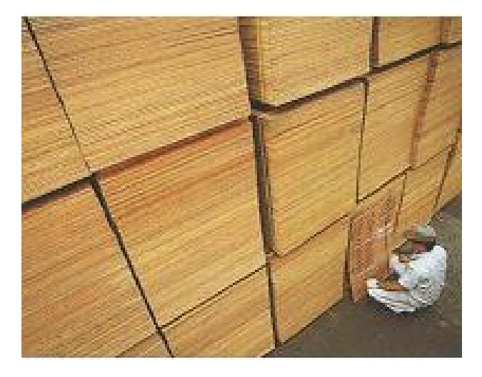
Worker at wood product company active in South Korea, Yanbian, and Chile

The first joint venture in Yanbian was established in 1986 between an American subsidiary of a South Korean company and the prefecture of Yanbian. Before the establishment of Sino-South Korean official relations. most foreign investments came from Korean-Americans or American affiliates of South Korean companies. By the end of 1992, a total of 131 of the 212 wholly or partly foreign-owned companies in Yanbian, sanzi giye, were run by ethnic Korean capital. The greatest part, consisting of 72 companies, had absorbed South Korean capital, and 10 had taken up North Korean capital. In all, 49 companies were partly or wholly financed by ethnic Koreans from other countries such as the United States, Japan and Canada. At least in these 49 cases, it could be reasonable to argue that ethnic and family ties had played an important role in the investment decision. In 1996, an official in the foreign trade administration informed me, foreign investors from countries other than South