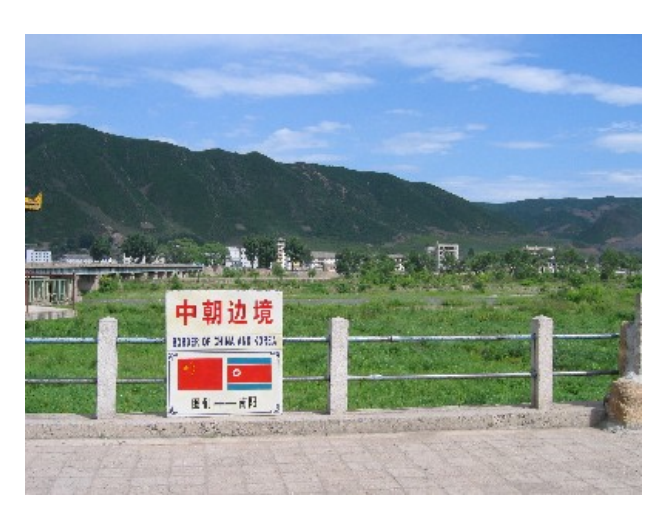
North Korean border viewed from Yanbian

Direct trade between China's coastal provinces and South Korea flourished starting in the late 1980s, despite the lack of official relations between the two countries. Indirect trade began around the time of the Asian Games, which took place in Seoul in 1986; China's participation in the games signalled a changed attitude towards South Korea. South Korean investments were soon directed toward southern China, the region then most open to foreign investment. Following the Seoul Olympics in 1988, direct trade between the two countries began, and South Korea investments moved northward, mainly to Shandong and Liaoning provinces, which are closest to South Korea.