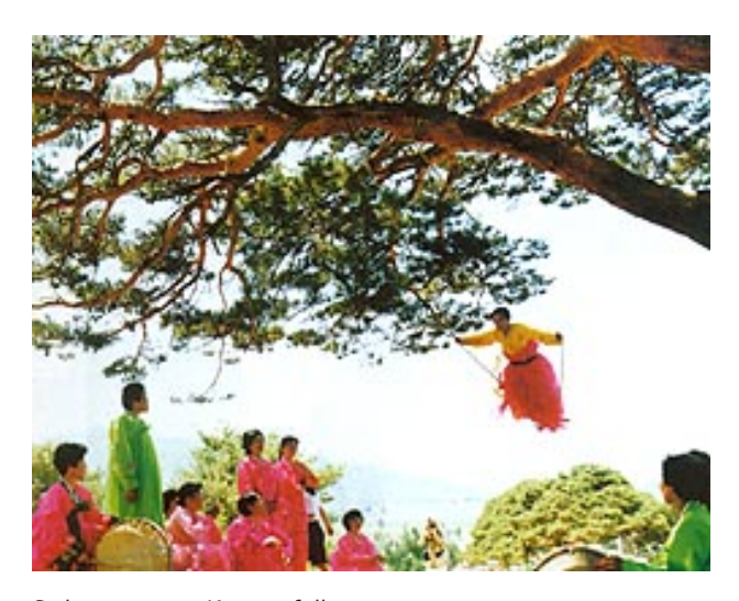
Swing game at Korean folk customs festival, Yanbian

Since the mid-1980s. Yanbian's contacts with South Korea and other countries have gradually expanded through unofficial channels drawing on ethnic and family ties. The first business contacts were created by associations, individual scholars, artists, and athletes. The first to "break the isolation" was a Yanbian University professor who visited West Germany and Sweden in 1982. Unofficial cultural exchange with South Korea began in 1989, when a famous Yanbian Korean poet visited several South Korean universities and a song and dance troupe from Yanbian performed in South Korea. In the mid-1980s, the Party-affiliated Yanbian Overseas Union hosted members of the Sino-Canadian Association for Economic and Cultural Exchange of the Korean People and the Friendship Association of Korean People in China and the United States. In 1988, the Yanbian