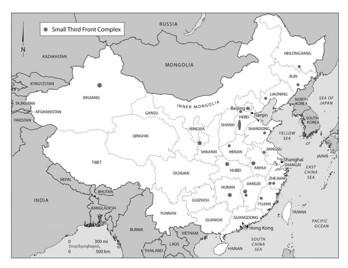
Map 2. The Small Third Front