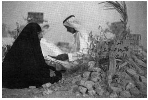
As if to surround a children's graveyard in central Basra city, I saw grave markers of citizens who became sacrificial victims of this war.

On July 8, the U.S. think tank, Nuclear Policy Research Institute, concluded that research on the impact of alpha radiation, the bystander effect, genomic instability and mutagenic capabilities of uranyl ions confirms that depleted uranium "is detrimental to the health of civilians and soldiers alike, particularly children" and asked the U.S. government to promptly stop its use.