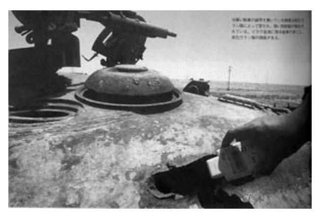
The bullet holes that pierced the armor of these tanks were caused by depleted uranium shells and strong radiation is observed.

Depleted uranium (DU) is not the only radioactive contamination decaying Iraq. A large tank looted from the Nuclear Energy Research Center in Tuwaitha, a suburb of Baghdad, was abandoned in a vacant lot of a residential area. There the yellow cake (uranium concentrate) of the nuclear fuel is exposed to the air, while geese drink the muddy water in the area and sheep graze.