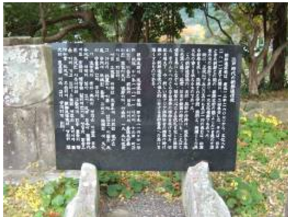
A stone monument for Korean embassies to Japan during the Edo period in Tsushima. The bilingual explanation board says that the Korean visits brought Japan sophisticated knowledge, art and