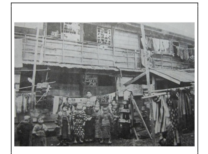
Tokyo tenement 1920

RAG-DEALER: Well, sir, there are all kinds of rag-dealers, and I happen to specialize in old clothing so I'll give you a much better price than other dealers would.