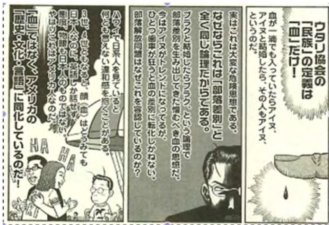
Figure 2: Next, Kobayashi weighs in on the Ainu Association's definition for having "blood" as its central tenet. He claims that this is similar to the burakumin situation in which even a single drop of burakumin blood ensures a risk of discrimination. For

Kobayashi, this is a dangerous form of chi no shisō ("blood thinking"). He then compares this to Nikkeijin in Hawaii for whom, having "assimilated" to American history, culture and language, "blood" just doesn't come into the picture (this is also his argument for calling Japan a "mono-ethnic state" ( tan'itsu minzoku kokka ) as, because Ainu culture developed as an hybrid amalgam in relation to Wajin (non-Ainu Japanese) culture, Ainu-Japanese ( Ainu-kei nihonjin ) are just one of the strands that make up the "mono-ethnic" Japanese people. He also uses this point to differentiate Ainu from Native Americans and Australian Aborigines who, unlike the Ainu, Kobayashi asserts, suffered genocidal oppression. (Source: Kobayashi Yoshinori, "Gekiron-ban Gōmanism Sengen: Okinawa to Ainu, 'Dōka' wo dō kangaeru ka?," Nishimura Kōsuke ed., Gekiron Mook: Okinawa to Ainu no Shinjitsu , Tokyo: ōkura Shuppan, 2009, p. 20).