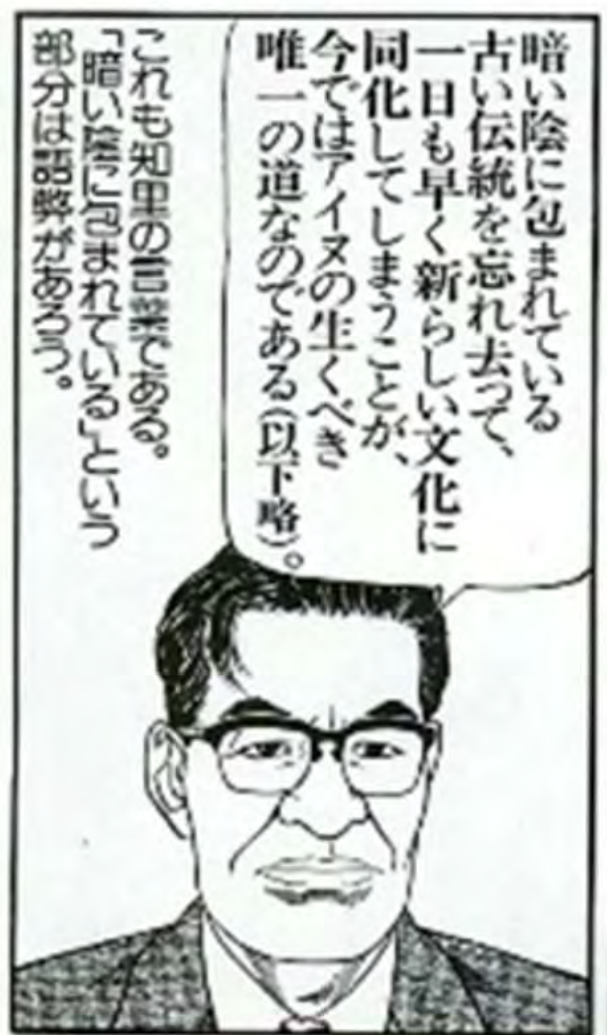
Figure 9: Chiri, in the afterword to Ainu Mintanshū , written in 1935, states, “the only path that the Ainu should try to live upon today is that in which they forget the old traditions wrapped in dark shadows and assimilate to a new culture as soon as possible.” The questions ignored here, however, are what Chiri meant by “assimilate” and “new culture.” That the break of modernity, and the problem of its critique and affirmation, provided the core motivation behind Chiri’s academic work is clear (Source: Kobayashi Yoshinori, “Gōmanism Sengen extra: Nihon Kokumin toshite no Ainu,” in Kobayashi Yoshinori ed., Washi-sm: Nihon Kokumin toshite no Ainu , Tokyo: Shōgakkan, 2008, p. 17).

What is scandalous about Kobayashi’s appropriation of these quotes is that Chiri’s phrase “Ainu-Japanese” ( Ainu-kei nihonjin ), which Kobayashi is so keen to highlight as an example of Ainu assimilation, represented, at heart, the despair of one who realized that it is “precisely the modern which always conjures up prehistory.” 27 For Chiri, expressing the current condition of being “Ainu” as being irreversibly “Ainu-Japanese,” there was no real