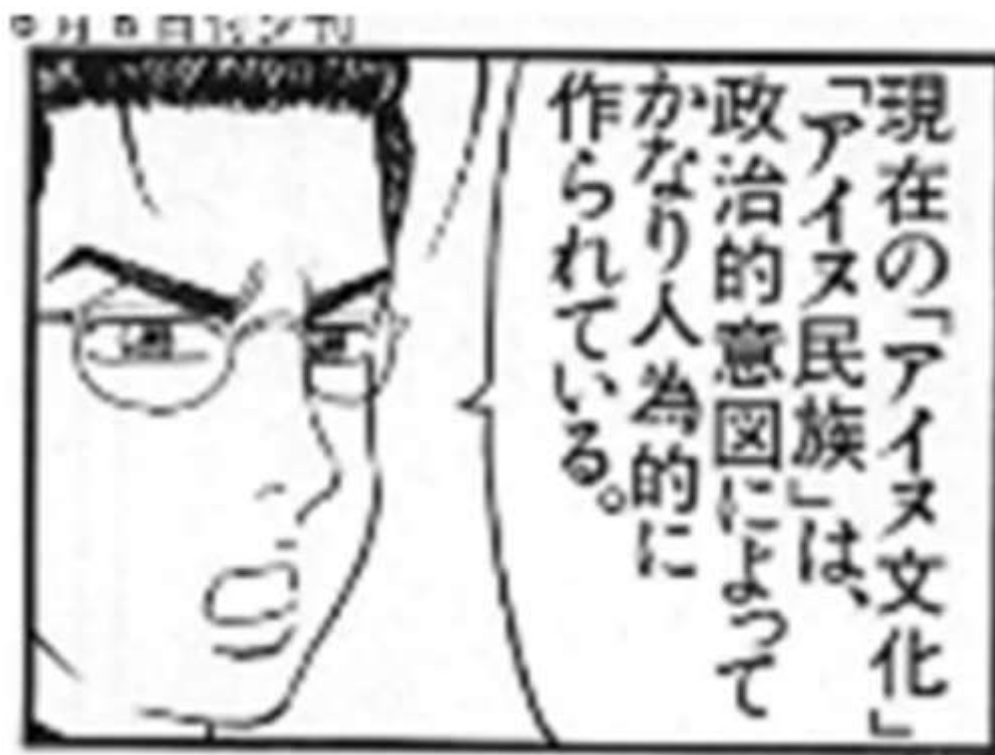
Figure 4: In his first outing into Ainu historiographic territory, Kobayashi’s inked-self claims, “Today’s ‘Ainu culture’ and the ‘Ainu People’ are, to a great extent, fabricated according to political motives” (Source: Kobayashi Yoshinori, “Gōmanism Sengen extra: Nihon Kokumin toshite no Ainu,” in Kobayashi Yoshinori ed., Washism: Nihon Kokumin toshite no Ainu , Tokyo: Shōgakkan, 2008, p. 44).

nationals according to previous forms of popular discipline. They try to defend a country, which can no longer enact its sovereignty in the same manner as before, through attempting to ensure that broken public commitments are re-promised. Overflowing with a spirit of revenge, they embrace this kind of empty hope and idealism – making the now familiar cry that Japanese “society must be defended.” Even if they do not embrace such high-minded idealism, unless they believe the major premise that “Japan” is somehow a “good country,” they somehow cannot imagine it even possible to proceed forward. They cannot rest unless they rebuild this sacred canopy “Japan” and defend it from everything and everyone that would have it fall apart. They do indeed wish to postpone living in the present so that they can give themselves up to the future of the country, even if this is ultimately an un-demanded and now nigh impossible task. In short, they are the typical modern vagabonds who embrace the kind of hope that Nietzsche abhorred as the basis for their deepest desires; the kind of “hope [that] is the worst of all evils, because it prolongs man’s torments.” 12