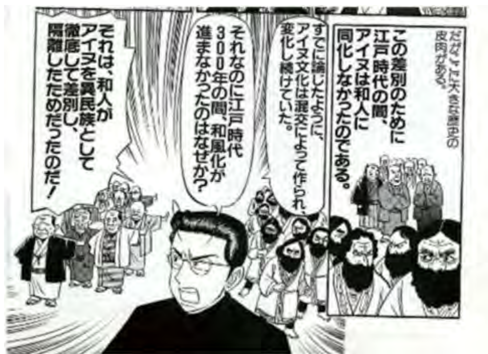
Figure 7: “Ainu culture” developed in a hybrid fashion alongside “Wajin culture.” So, why was it that after 300 years of the Edo period “Ainu” had not “Japanified”? Answer: “because Wajin thoroughly discriminated against Ainu as a different ethnicity and isolated them” from the rest of society. Not exactly wrong (Source: Kobayashi Yoshinori, “Gōmanism Sengen extra: Nihon Kokumin toshite no Ainu,” in Kobayashi Yoshinori ed., Washi-sm: Nihon Kokumin toshite no Ainu , Tokyo: Shōgakkan, 2008, p. 28).

What is surprising, however, is despite this refusal, the reason is brilliantly illustrated in Kobayashi’s manga itself. The reason why pre-modern “Japanification” ( wafūka ) and modern “assimilation” ( dōka ) were not ultimately successful and achieved was precisely, as Kobayashi himself asserts, “because Wajin thoroughly discriminated against Ainu as a different ethnicity and isolated them [from national society]!” 20 It is this point which supplies the main cause for Kobayashi performing the role of “Shamo” so well in his attitude displayed toward “Ainu” in his manga: he refuses to pursue the relationship that exists between discrimination and assimilation.