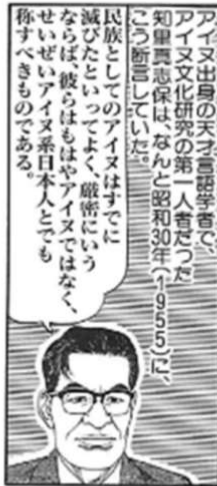
Figure 8: Chiri, the “genius linguist of Ainu origin” and the scholar at “the forefront of Ainu culture studies” claimed in 1955 that Ainu “as a people/ethnos ( minzoku ) can be...” (Source: Kobayashi Yoshinori, “Honke Gōmanism Sengen Dai-rokuwa: Ainu ‘Minzoku no Decchi-age’ wo Yurusuna!” [Original Haughtiness Manifesto Part Six: Do not Forgive the ‘Fabrication of an Ethnic’ Ainu!], in Will , Tokyo: Wakku Shuppan, April 2010, p. 198).