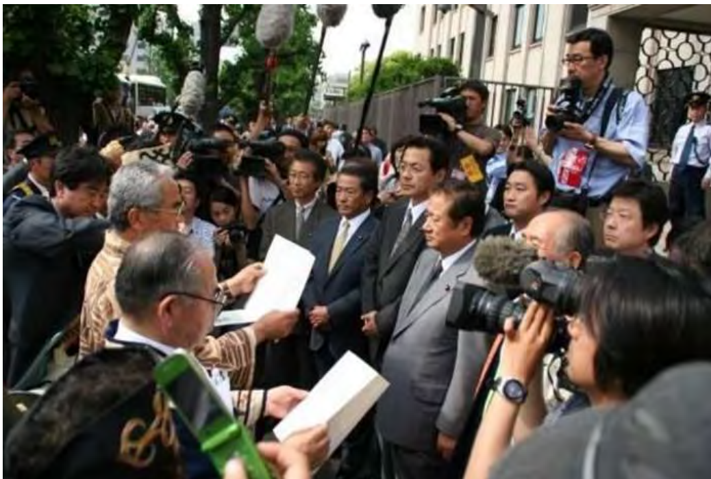
The chairman and directors of the Hokkaido Utari Kyōkai present demands to Hokkaido politicians during a demonstration on 22nd May 2008

While it is the cultural reverence offered to the idea of Japan as a "homogeneous state" ( tanitsu minzoku kokka ) that is most often commented upon in the English language literature, for many years now the only real points of concern and resistance put up by the Japanese government against legislating greater Ainu rights and recognizing them as an indigenous people in the context of the UN Declaration, have been worries over its compatibility with the Constitution, and the ability to ensure the state's final say on any kind redistribution of resources that might take place as a result. In other words, it is concerns over the status of state sovereignty that are at issue. This is why, for an equal number of years, organizations like the Hokkaido Utari Kyōkai (now renamed the Hokkaido Ainu Kyōkai, or known by its English name, the Ainu Association of Hokkaido) have repeatedly stated that they are not interested in land redistribution, or any kind of state-like independence. As the official channel between the state and Ainu affairs to date, as well as being the largest organization representing Ainu in Hokkaido, the demands of the Kyōkai, originally mapped out in their Draft Law Concerning the Ainu People of 1984 12 , have been consistently tame and concentrated on educational scholarships and employment assistance in an effort to better the living standards of its members 13 .