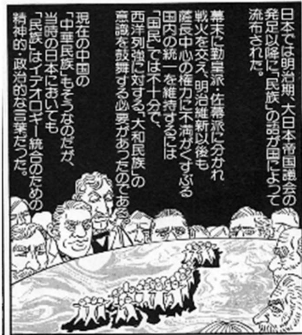
Figure 5: And yet, in explaining the existence of the “Yamato people” ( Yamato minzoku ), he claims, just like with the notion of “the Chinese” ( chūka minzoku ) today, the “Yamato people” was an important “psychological and political word used for ideological cohesion” against the threat of Western powers and to counter internal strife after the Meiji Restoration. Empiricism and political pros and cons aside, is it so hard to imagine that the “Ainu people” ( Ainu minzoku ) enjoys a similar ideological purpose with regard to, say Indigenous rights? (Source: Kobayashi Yoshinori, “Gōmanism Sengen extra: Nihon Kokumin toshite no Ainu,” in Kobayashi Yoshinori ed., Washi-sm: Nihon Kokumin toshite no Ainu , Tokyo: Shōgakkan, 2008, p. 19).

The now familiar insight of Lacanian psychoanalysis that “lack (“castration”) is originary” also precisely describes this state of being. 13 Kobayashi and his alter-ego’s vision for “Japan” can only be embraced as something viable through the nagging presentiment that the “Japan” they wish to defend simply doesn’t exist in the first place. In order for that “Japan” to be viable they must discover as many phantom-like “fifth columnists” as possible. Their