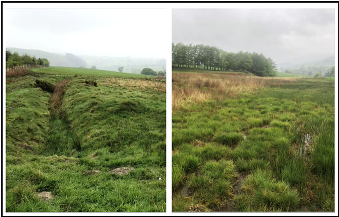
Fig. 1. Example of a watercourse habitat (left) and pasture habitat (right), both from Farm B in this study.