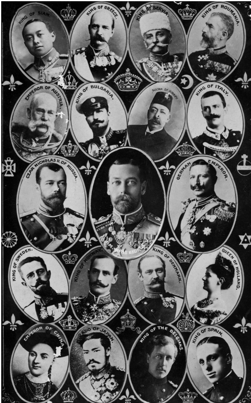
Figure 1. British postcard showing 'Ruling Monarchs', including portraits of the king of Siam, the Ottoman sultan, the Meiji emperor of Japan, and the Guangxu emperor of China, 1908.