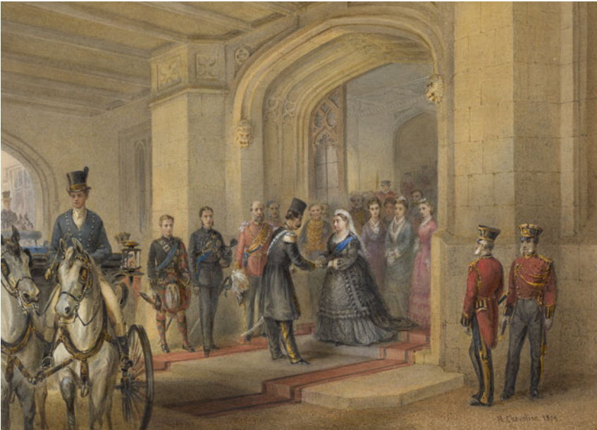
Figure 2. The reception of Nasir al-Din Shah at Windsor Castle, 20 June 1873, watercolour by Nicholas Chevalier from 1874 (Royal Collection Trust, RCIN 920788).

their visits. 19 Nasir al-Din Shah, for instance, gave two major reasons for visiting Europe. First, ‘meeting the great kings of Europe for the consolidation of good relations and the enhancement of friendship and mutual cooperation’. 20 Second, ‘collecting all information and gathering experiences, which can be valuable for the Iranian government and nation’. The shah’s grand vizier, Mirza Husayn Khan (Mushir al-Dawlah), one of the architects of the journey, emphasized in a letter to his monarch: ‘This royal effort is not merely for tourism; it is a great main road that will lead to Iran’s progress.’ 21 Muzaffar al-Din Shah gave similar reasons at the outset of his first European journey. 22 King Chulalongkorn, in a memorandum, mentioned three motives for his European travels: to establish friendly relations with Europe’s monarchs and make his country known to the world; to study European administrative, legal, military, and educational innovations; and to repair Franco-Siamese relations which had been tarnished by a military confrontation in 1893. 23 The