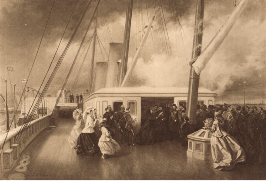
Figure 5. Queen Victoria invests Sultan Abdülaziz I with the Order of the Garter on board the royal yacht Victoria and Albert, 17 July 1867, watercolour by George Housman Thomas from 1867 (Royal Collection Trust, RCIN 450804).

of friendship & as a personal souvenir'. 60 Evangelical circles at Windsor were pushing hard in the late nineteenth century to convince the court that only Christian rulers were to be honoured with the order. Abdülaziz also received the Royal Order of the Legion of Honour ( Ordre Royal de la Légion d'Honneur ) with brilliants from Napoleon III. 61 In Prussia, he conferred upon Wilhelm I the Order of Osmani ( nişan-ı osmani ) with brilliants, while he himself wore the Order of the Black Eagle ( Schwarzer Adlerorden ). 62 He also presented Franz Joseph of Austria-Hungary with the Order of the Mecidi ( nişan-ı mecredi ) with brilliants, while receiving the Order of Saint Stephen ( Sankt-Stephans-Orden ), the highest Habsburg decoration. 63