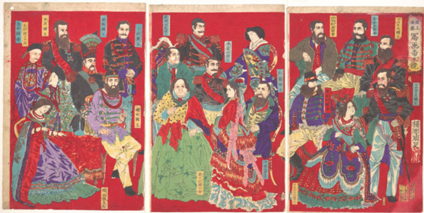
Figure 8. Portrait of world sovereigns ( Sejō kakkoku shaga teiō kagami ), showing, besides European royalty, Persia's Naser al-Din Shah, China's Guangxu Emperor and Empress Dowager Cixi, and Japan's Meiji emperor and his wife Empress Shoken, Japanese woodblock print by Yōshū (Hashimoto) Chikanobu, 1879 (Metropolitan Museum, New York, and Alamy).