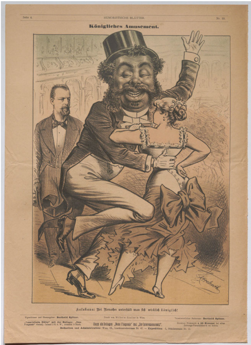
Figure 7. King Kalākaua's 'royal amusement' in Vienna, caricature by L. Appelrath, printed in Humoristische Blätter , 1881.

state for foreign affairs, wrote to Henry Wellesley, Lord Cowley, the crown's ambassador to Paris, even considering putting pressure on her through parliament and the press. 121 The queen, who at the time was still secluded in deep mourning after the death of the prince consort in 1861, in the end, consented.