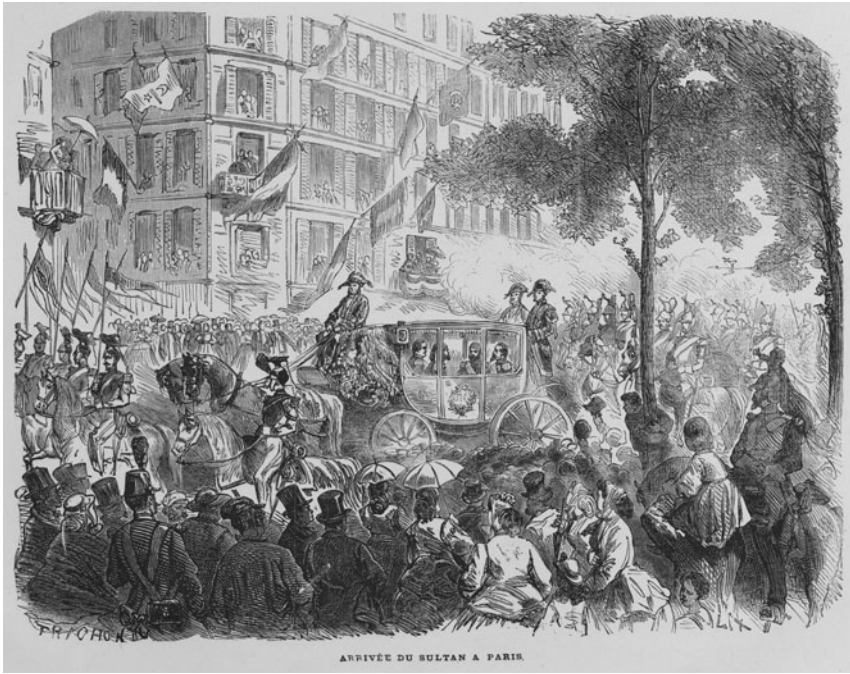
Figure 3. Sultan Abdülaziz I and Napoleon III in Paris, 1867, engraving from 1868.

sisterly. 44 Queen Victoria invited Emma back, and to remain at Windsor overnight, subsequently commenting on the ‘good Queen Emma’: ‘She was amiable, clever, & nice, in all she said, speaking of her own country.’ 45 The widowed queens became friends; a life-long correspondence between the two followed. 46 Similarly, Tsesarevich Nicholas, when visiting Siam in 1891, forged a lasting friendship with Chulalongkorn. After arriving in Russia in 1897, the Siamese sovereign noted in one of his letters home the warm welcome he had received at the court of his friend, who was now Tsar Nicholas II: ‘The mother of the Tsar even calls me “my son” and I told her that she was like my mother. She gives me a kiss every day and today I really feel like being her son, so I offered her my check to be kissed.’ 47 The photographs taken of the monarchs