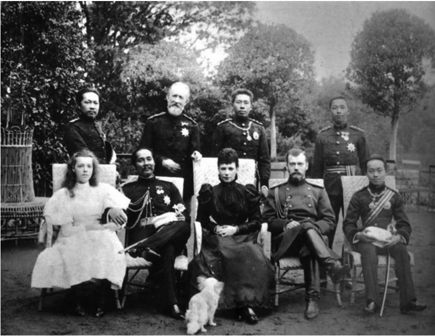
Figure 4. King Chulalongkorn, Tsarina Alexandra Feodorovna, and Tsar Nicholas II, sitting in the centre, at Alexander Palace, south of St Petersburg, 1897. The Siamese king links arms with the tsar's younger sister, Grand Duchess Olga Alexandrovna.

during the visit, resembling family pictures, visualized their bond of friendship (Figure 4). The images were, to be sure, also of political significance. Chulalongkorn apparently even wanted to publish one of them in all countries he was to visit to show the world that he was a legitimate member of the global community of monarchs.