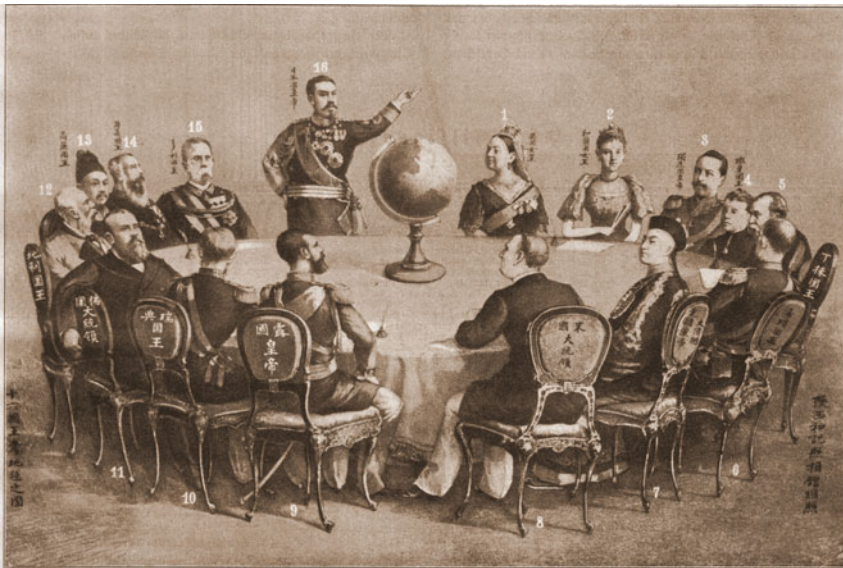
Figure 9. Leaders of sixteen countries in a gathering envisage a desirable future world, showing the Meiji emperor (16), Queen Victoria (1), Queen Wilhelmina (2), Wilhelm II (3), Alfonso XIII of Spain (4), Christian IV of Denmark (5), Chulalongkorn (6), Guangxu Emperor (7), President William McKinley (8), Nicholas II (9), Oscar II of Sweden (10), President Émile Loubet (11), Franz Joseph (12), Gojong of Korea (13), Leopold II (14), Umberto I of Italy (15), Japanese illustration by unknown artist, 1903.