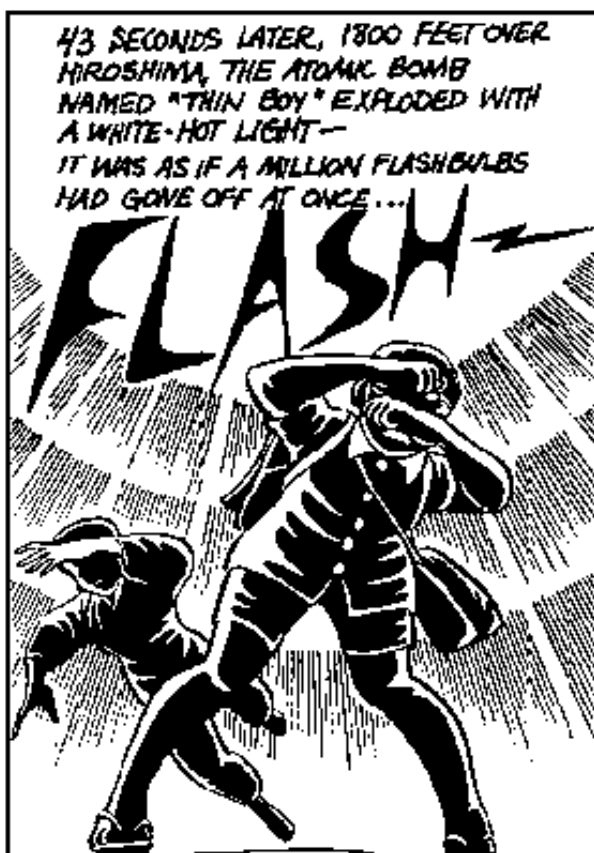
The atomic bomb explodes