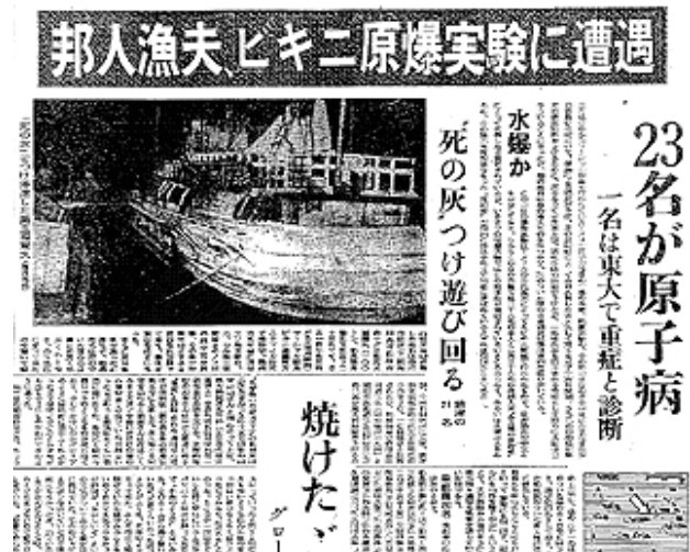
Yomiuri newspaper reports on the Lucky Dragon #5, March 16, 1954