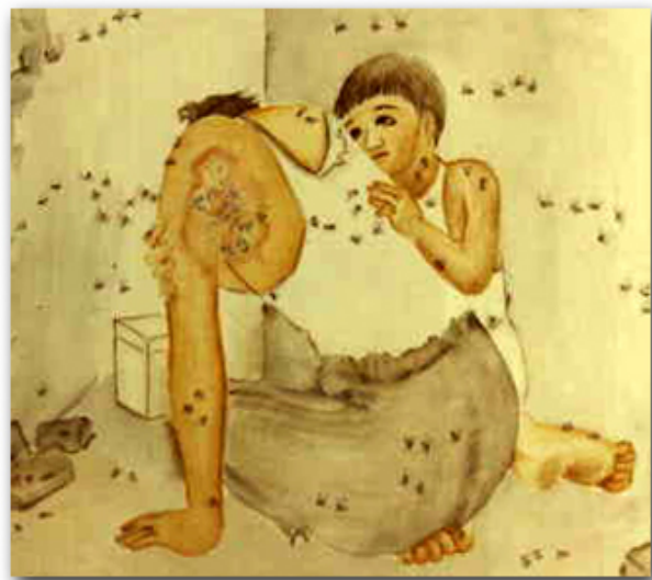
A child clings to mother whose wounds bred maggots 11 days after the bomb. Drawing by Ichida Yuji.

couldn’t open your eyes. And they attacked you! Despite the atomic bomb, flies bred. It’s strange, but maggots are really quick. In no time at all they were everywhere. Horrible, really. And that maggots should breed like that in human bodies! If you wondered what that was moving in the sky, it was a swarm of flies. The only things moving in Hiroshima were flames as corpses burned, and flies as they swarmed.