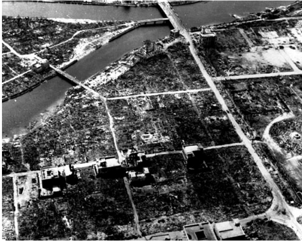
Aioi bridge after the atomic bomb.

The atomic bombing was terrible, of course, but we also suffered afterward from hunger. For a while we stayed in Eba. After the war the food shortage was really severe. At the river's mouth in Eba, when the tide went out, there stretched an array of rib bones. If you dug under the rib bones, there were lots of short-necked crabs. They fed on the bodies. Lived off of human beings. We gathered the crabs for all we were worth and with them appeased our hunger. Would you say we were blessed by the sea?—there were the seven rivers, and it really helped us appease our hunger.