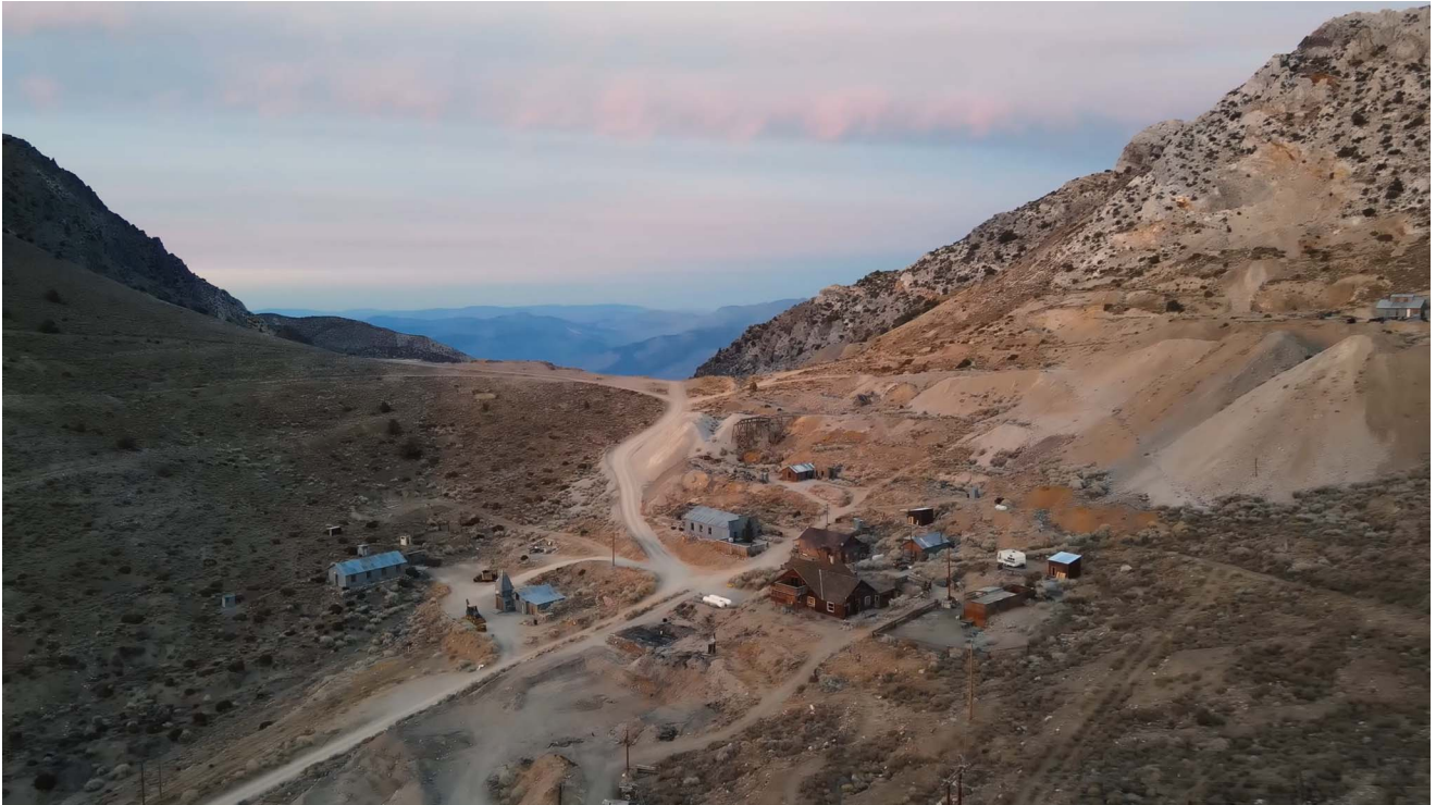
Figure 3. The ghost town of Cerro Gordo. (Screenshot from Underwood 2020a at minute 2:42.)