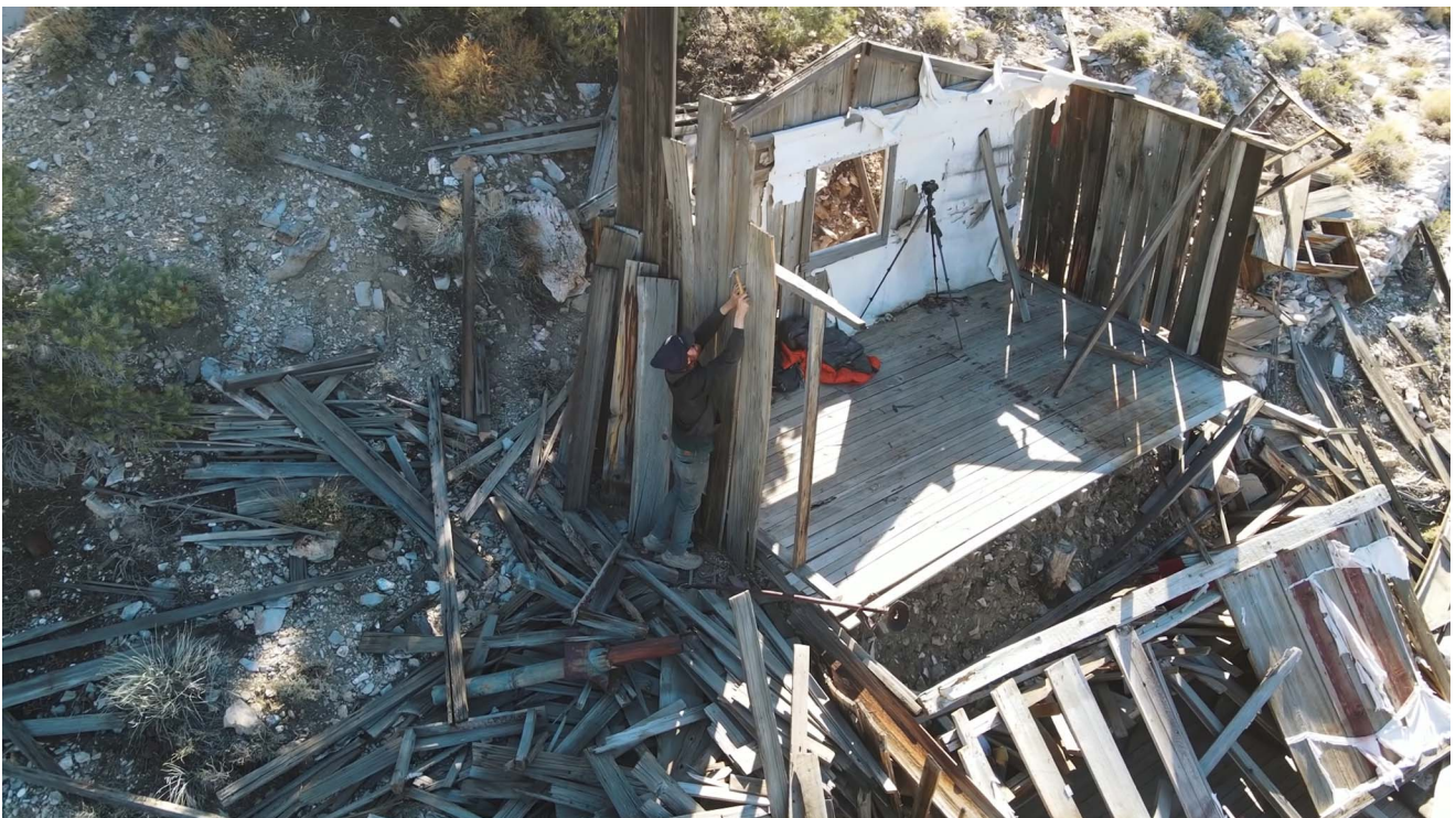
Figure 4. Underwood rebuilding a cabin. (Screenshot from Underwood 2021b at minute 22:29.)