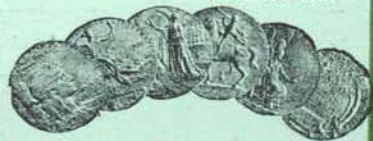
Gold Medal (Highest Award), Allahabad 1910.

GRANDS PRIX: Paris 1900, Brussels 1910, Buenos Aires 1910.