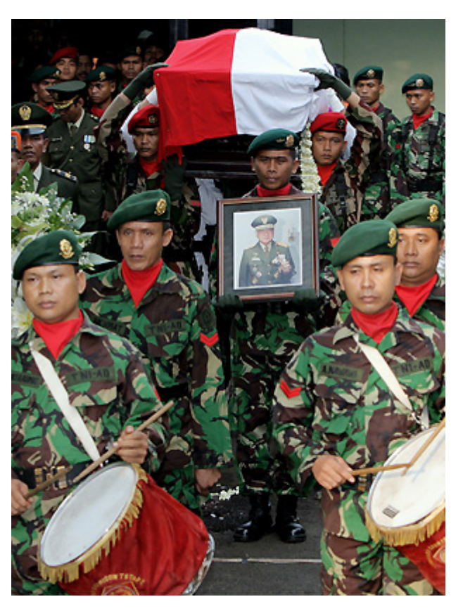
Suharto received a state funeral with full military honors

Laid to rest Monday, January 28, 2008 in a state funeral with full military honors at a family mausoleum outside Solo in central Java, former Indonesian strongman and president, Suharto, is truly buried. But, how has his legacy been appraised in the local, regional and global media? Indeed, what shadow has he cast over Indonesia beyond the grave, having died in bed surrounded by Indonesian and Asian dignitaries, not vilified in prison or exile, having evaded prosecution for embezzlement, not to mention human rights abuses?