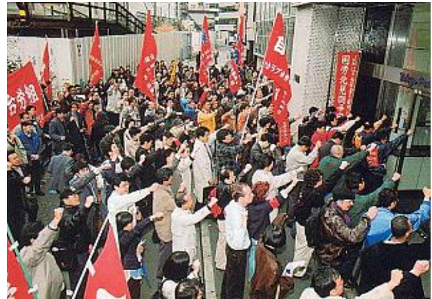
National Union of General Workers, Tokyo