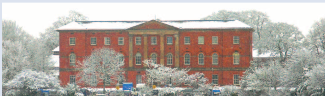
The British Journal of Psychiatry (2011) 198, 335. doi: 10.1192/bjp.198.5.335