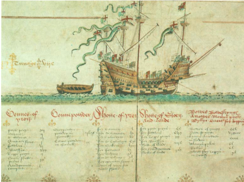
Henry VIII's warship, 'Mary Rose', lost off Portsmouth in action against the French in 1545, as depicted in the sixteenth-century Anthony Roll in the Pepys Library, Magdalene College, Cambridge. (See Editorial, p. 2)

By kind permission of the Master & Fellows of Magdalene College, Cambridge