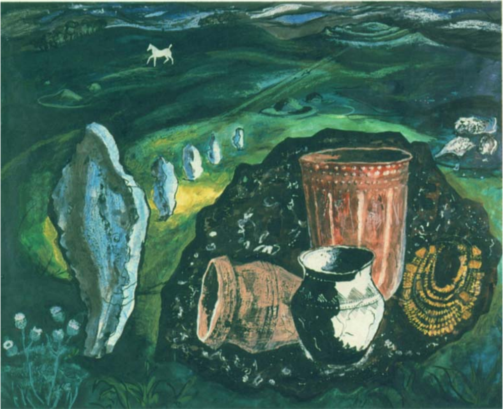
Cartoon by John Piper for the Devizes Museum stained glass window