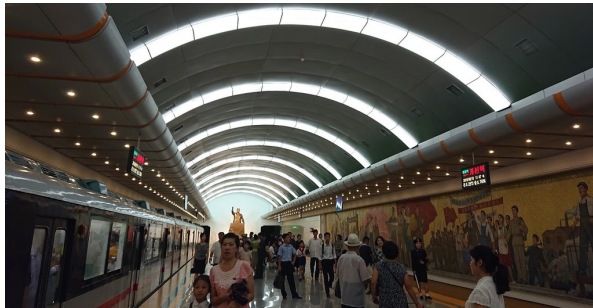
At a subway station in Pyongyang

Even now that efforts to end the war and denuclearize the Korean Peninsula have been ongoing since the Pyeongchang Olympics last year, Japan has not budged an inch in its demonization of the DPRK. This includes excluding Korean schools in Japan from the government tuition subsidy program, and even going so far as to take away souvenirs that people with roots in the DPRK bring home from their visits to the DPRK, allegedly as Japan's own unique form of economic sanction, but truly a policy that amounts to no more than harassment. There is not a shred of remorse for Japan's colonial rule, and its role in support of the United States in the Korean War and continued division.