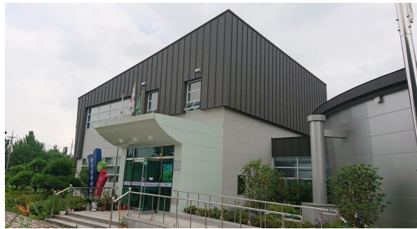
Hapcheon Atomic Bomb Museum

anti-Japan; it's anti-Abe administration."