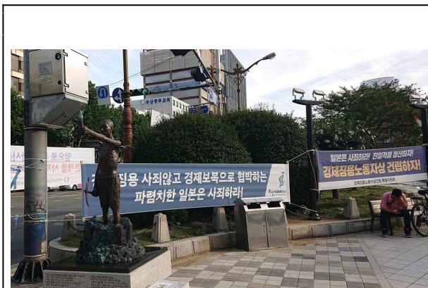
“Forced Labor” statue at a park near the Japanese consulate in Busan.

On July 22, six university students staged a protest at the Japanese consulate in Busan and were arrested, an incident that was widely reported. On a road adjacent to the Japanese consulate in Busan is a statue of a young girl erected to remember Japanese military sex slavery, and she, like the statue of a conscripted wartime laborer in a park near the consulate, faces the consulate, almost as though she is quietly watching over the events that occur there.