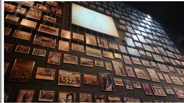
Wall to remember the victims of forced labor

The museum not only remembers the victims; it points to the perpetrators as well. At the Museum there is a list naming around 300 Japanese companies that utilized forced mobilization to grow and are still thriving today, including many major Japanese corporations such as the Mitsubishi, Mitsui and Sumitomo corporate groups. After its “liberation” following Japan’s defeat, Korea was divided in two, and more than 3 million people were killed in the Korean War that followed. The Japanese economy used this war as an opportunity for growth by means of “special procurements” whereby Japanese corporations enjoyed increased demand from the U.S. military and others involved in the war. The list of companies included the company where my father worked. Even though I have no direct responsibility for forced mobilization, I have reaped the benefits of a Japanese economy that achieved growth by trampling on the lives and dignity of the people of the Korean peninsula.