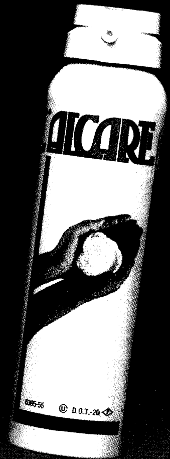
Alcare® Foamed Alcohol

CALGON VESTAL LABORATORIES DIVISION OF CALGON CORPORATION SUBSIDIARY OF MERCK & CO., INC.