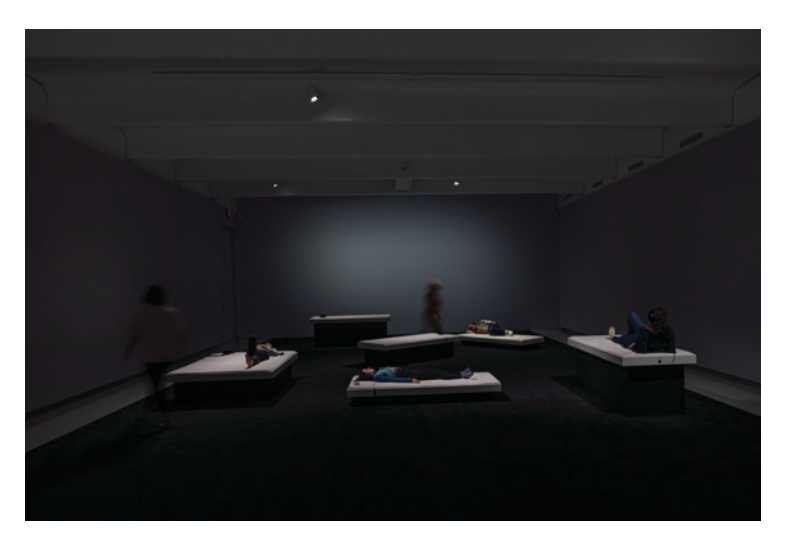
Figure 3. Faye Driscoll's Come On In at the Walker Art Center, Minneapolis, 27 February–14 June 2020.

even after their death. Such tensions become particularly rich in artistic works that are about the nature of control, and in this case, the gendered and sexualized nature of control as it relates to touch.