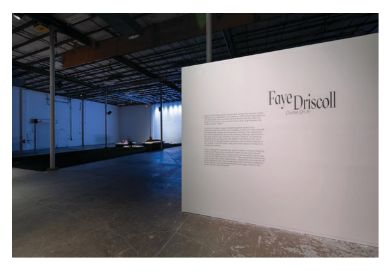
Figure 5. Faye Driscoll's Come On In at Portland Institute for Contemporary Art, Portland, Oregon, 19 November 2021–15 January 2022.

installation, just Driscoll's voice performing live with a microphone—Lion's Jaw producer Jared Williams pointed out that the audience's familiarity with such exhortations to mindfulness was received as humorous initially. As the monologue unfolded, Williams noted, "she slowly started to add more of her own needs and desires into the prompts" (Williams 2022). The relationship between the speaker and her imagined listener shimmers with lust, affection, perhaps embarrassment. "My baby," Driscoll whispers at intervals. Without such intimate language,