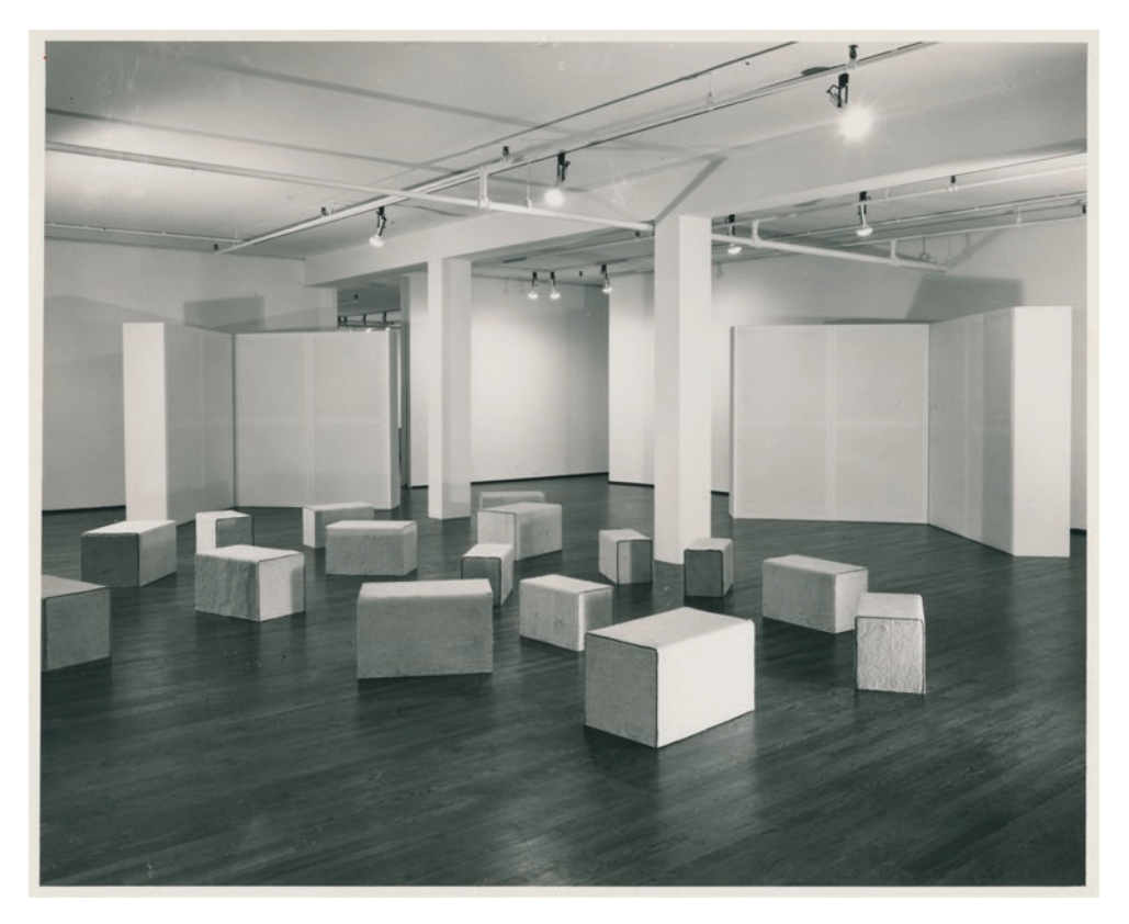
Figure 4. Robert Morris's Voice, Castelli Gallery, New York, 2020. (Photo courtesy of Castelli of Gallery. © 2023 The Estate of Robert Morris/Artists Rights Society [ARS], New York)

Emil Kraepelin, describing the early diagnostic methods used to define schizophrenia and bipolar disorder, and featuring a male-presenting voice and a female-presenting one, often overlapping with each other (1974:47). "In all of this," wrote Gilbert-Rolfe, "the use of Kraepelin is signally apposite; it suggests with a particular succinctness that the elevated but strained rhetoric of the performer-hero has its origin in public knowledge, that the individual—as he's known and as he comes to know himself—is the product of an institutional vernacular that precedes him and provides the vocabulary that comes to be identified as his own" (47). This slippage between personal epistemology and institutional vernacular is at stake in both Voice and, 46 years later, Come On In.